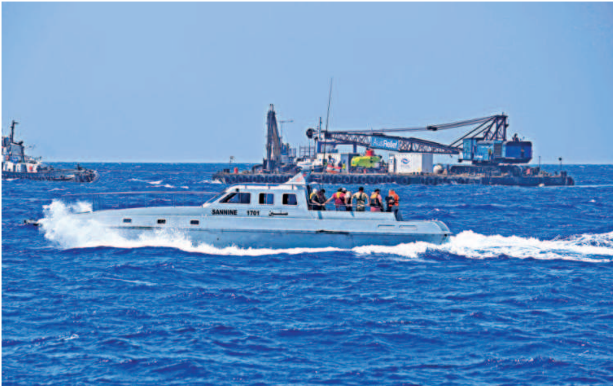
A Lebanese Navy boat carrying relatives of victims sails past a launch platform for a submarine operation intended to find and salvage the wreckage of a boat carrying illegal migrants that capsized in April some 10km off the shores of Tripoli, at an event in the northern port city yesterday.

AFP, Geneva Swiss glaciers have shed half their volume since 1931, Swiss researchers said yesterday, following the first reconstruction of the country's ice loss in the 20th century. Rapid glacier melt in the Alps and elsewhere, which scientists say is driven by climate change, has been increasingly closely monitored since the early 2000s. However, until now there has been little insight into how glaciers changed prior to that during the 20th century, with only a handful of individual glaciers tracked over time, and with different models for estimating their volume. But Swiss researchers from the ETH Zurich technical university and the Swiss Federal Institute for Forest, Snow and Landscape Research WSL say they had now reconstructed the topography of all Swiss glaciers in 1931, making it possible to show how they have evolved. "Based on these reconstructions and comparisons with data from the 2000s, the researchers conclude that the glacier volume halved between 1931 and 2016," they said in a statement. Their study was published in the scientific journal The Cryosphere.