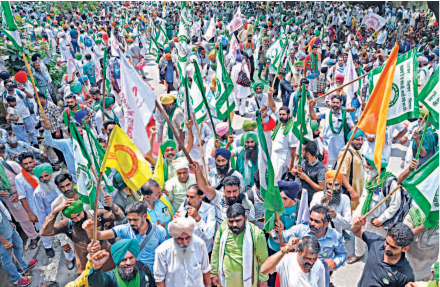
Farmers from various organisations gather as they participate in a protest against the central government policies, in New Delhi, India yesterday. Farmers are demanding that the government guarantee a minimum support price for all produce and clear all farmer debts, among other things, according to a statement from the Samyukta Kisan Morcha, the farmer organisation that organised the protest yesterday.

calling for thorough exercises based on real-world scenarios. The drills were the largest since 2017 after being scaled back because of Covid-19 and as Yoon's predecessor sought to restart talks with Pyongyang, which has called the exercises a rehearsal for invasion. North Korea fired two cruise missiles from the west coast last week, after South Korea and the United States kicked off preliminary training for the exercises. North Korea has conducted missile tests at an unprecedented pace this year and is ready to conduct its seventh nuclear test at any time, Seoul officials said. Yoon has said his government is willing to provide economic aid if Pyongyang takes steps toward denuclearisation, but North Korea has rebuffed his offer, openly criticising him. Seoul's defence ministry has said the allies would stage 11 field training programmes, including one at brigade-level - involving thousands of soldiers - this summer. To better counter North Korea's growing missile threats, the ministry said it would improve missile detection capabilities and push for an early deployment of a new interceptor system.