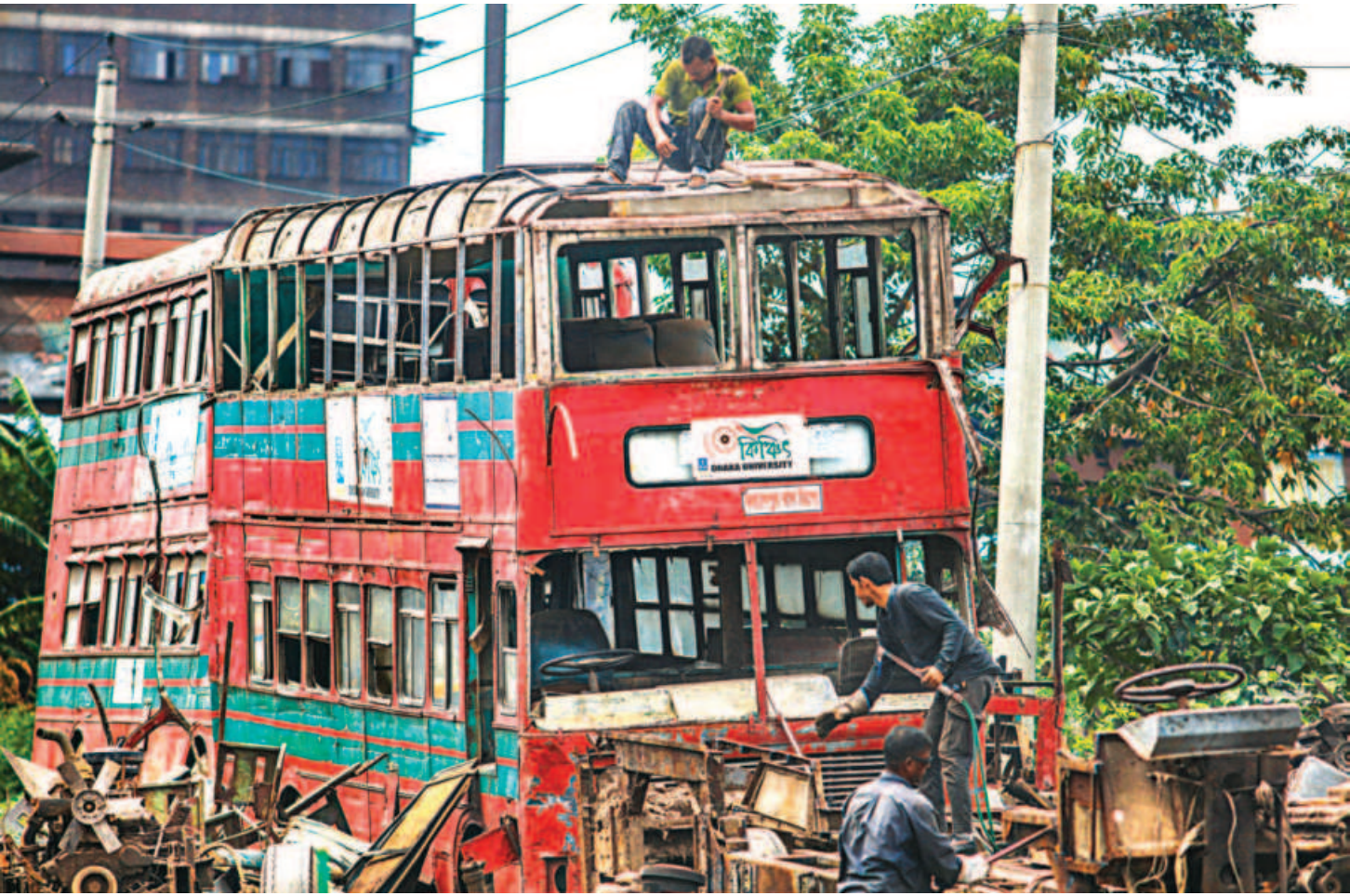
If you've ever wondered what happens to old buses when they are not in use anymore, the answer is simple -- they get scrapped. These workers spotted in the Postogola area recently were taking apart a bus's metal exterior after it was sold to them by the bus authorities. Different parts of the bus are again sold to different parties after which the parts go through a second round of recycling.