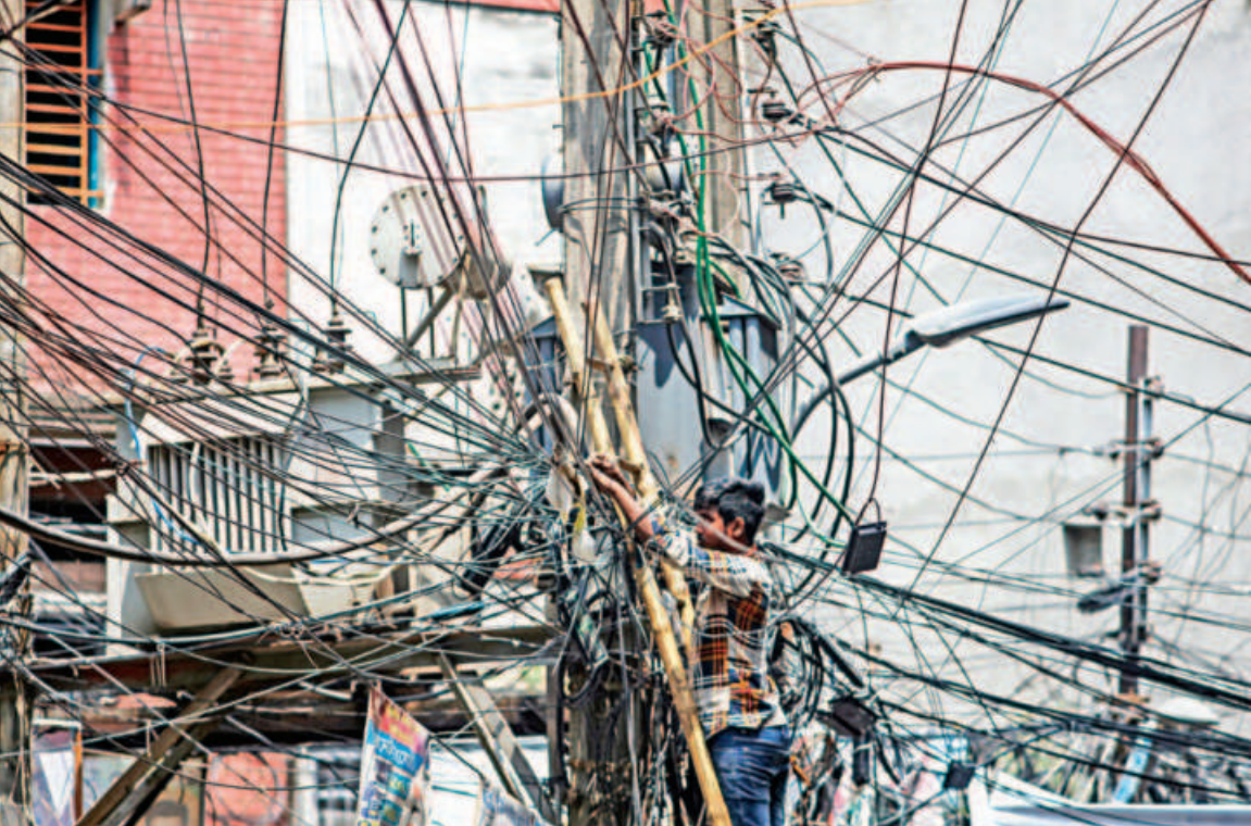
Standing on a high-voltage electric post, a worker tries to connect an internet line, an act that is illegal. Many internet-providing companies connect private lines in this manner, risking their workers’ lives while conducting their business. This photo was taken from the Labagh area yesterday.