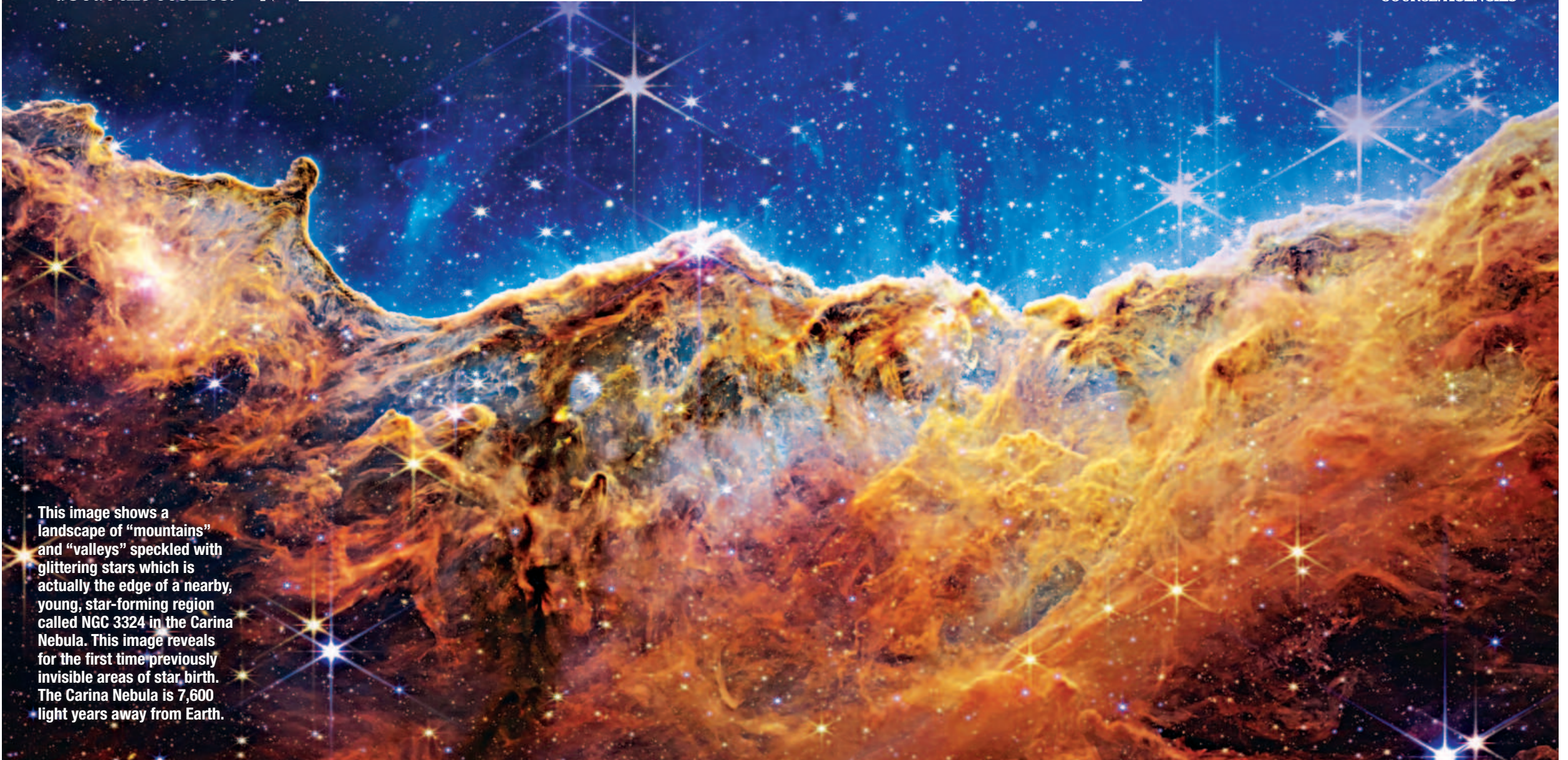
This image shows a landscape of "mountains" and "valleys" speckled with glittering stars which is actually the edge of a nearby, young, star-forming region called NGC 3324 in the Carina Nebula. This image reveals for the first time previously invisible areas of star birth. The Carina Nebula is 7,600 light years away from Earth.