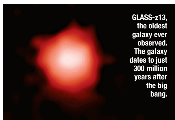
GLASS-z13, the oldest galaxy ever observed. The galaxy dates to just 300 million years after the big bang.