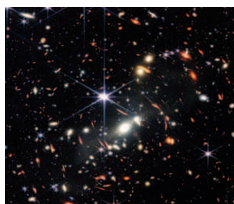
obtained on July 11, 2022, shows the first infrared image from the James Webb Space Telescope.