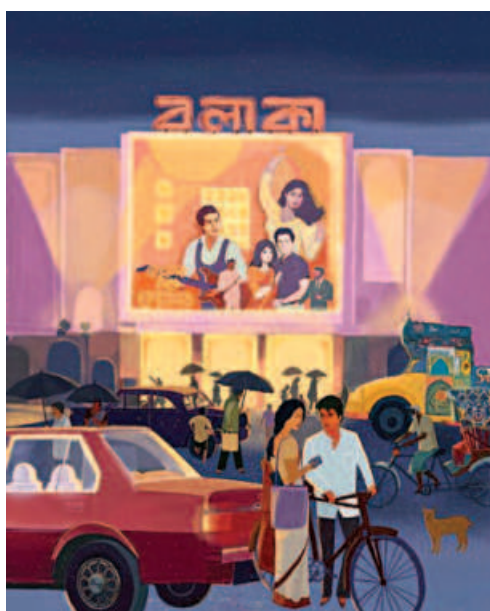
ILLUSTRATION: DHAKA YEAH

country on Eid-ul-Azha, reaching up to 41 on its second week, and 60 within its fourth. The film has also been released in Australia, Finland, Denmark and Sweden.