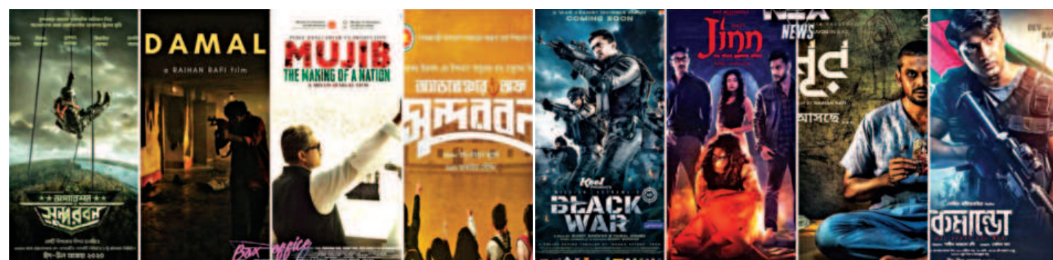
Upcoming films of the industry.