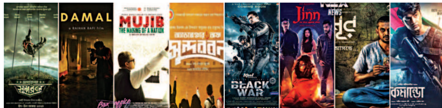
Upcoming films of the industry.

An exciting line-up of films, including "Operation Sundarban", "Mujib: The Making of a Nation", "Adventure of Sundarban", "Mission Extreme 2", "Noor", "Jinn" and "Commando" awaits us. Now that Shakib Khan is back in Bangladesh, his films "Maya", "Leader: Ami Bangladesh", "Antoratta" and "Kobi" will undoubtedly create hype as well. Now, it is as much a duty of ours to extend them the same support we have shown our recent films, as is theirs to provide top-tier entertainment.