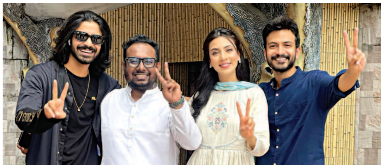
The team of 'Poran'.