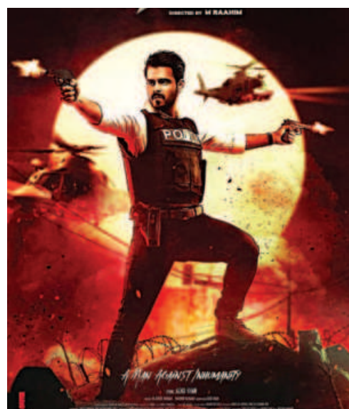
Siam Ahmed in 'Shaan'.

“We need more films like Hawa and Poran”