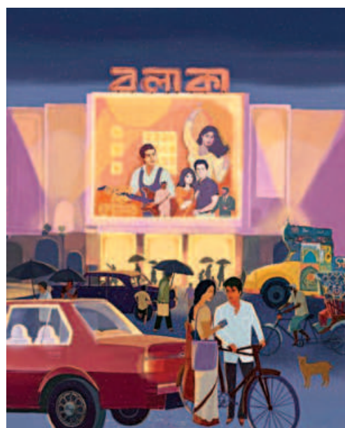
ILLUSTRATION: DHAKA YEAH

country on Eid-ul-Azha, reaching up to 41 on its second week, and 60 within its fourth. The film has also been released in Australia, Finland, Denmark and Sweden.