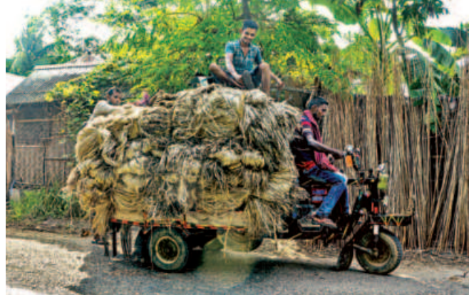
Women carefully separating jute fibre from retted stalks. Inset, freshly harvested jute stalks being carried for the process of water retting. In this step, the bundles are soaked in water to swell the inner cells and burst the outermost layer. This makes the process of separating the fibre from the stalk easier. The photos were taken from different areas in Narail yesterday.