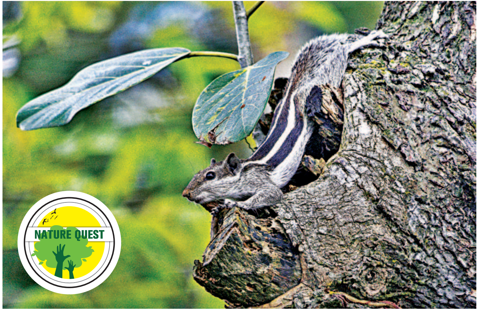
MISCHIEF MANAGED ... An Indian palm squirrel stretching his back after doing some hard work of hiding nuts in a small hollow of a tree in Khulna city's Mujgunni area. This considerably cute rodent is widespread and widely liked, despite a knack for mischief. It is found mainly in India and its neighbouring countries, including Bangladesh.