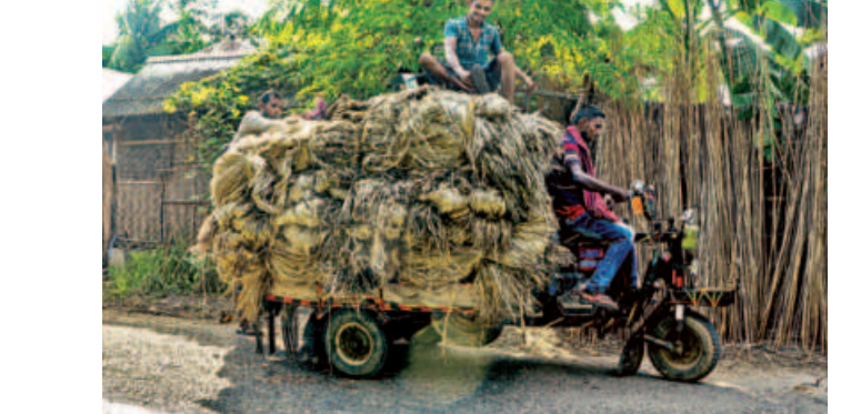
Women carefully separating jute fibre from retted stalks. Inset, freshly harvested jute stalks being carried for the process of water retting. In this step, the bundles are soaked in water to swell the inner cells and burst the outermost layer. This makes the process of separating the fibre from the stalk easier. The photos were taken from different areas in Narail yesterday.