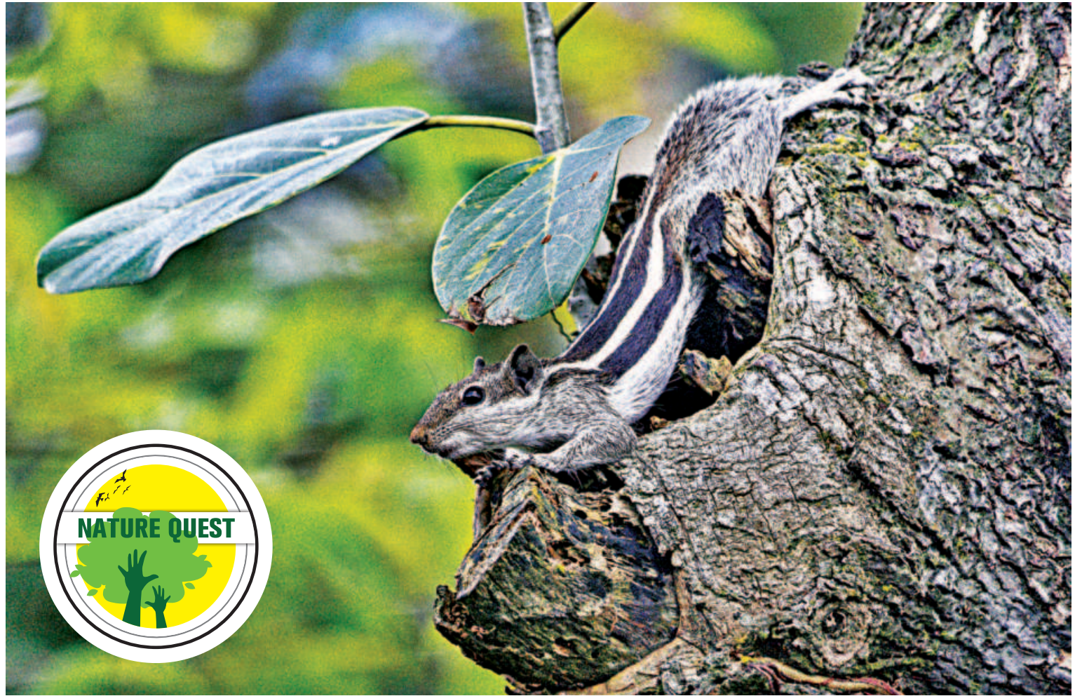
MISCHIEF MANAGED... An Indian palm squirrel stretching his back after doing some hard work of hiding nuts in a small hollow of a tree in Khulna city's Mujgunni area. This considerably cute rodent is widespread and widely liked, despite a knack for mischief. It is found mainly in India and its neighbouring countries, including Bangladesh.