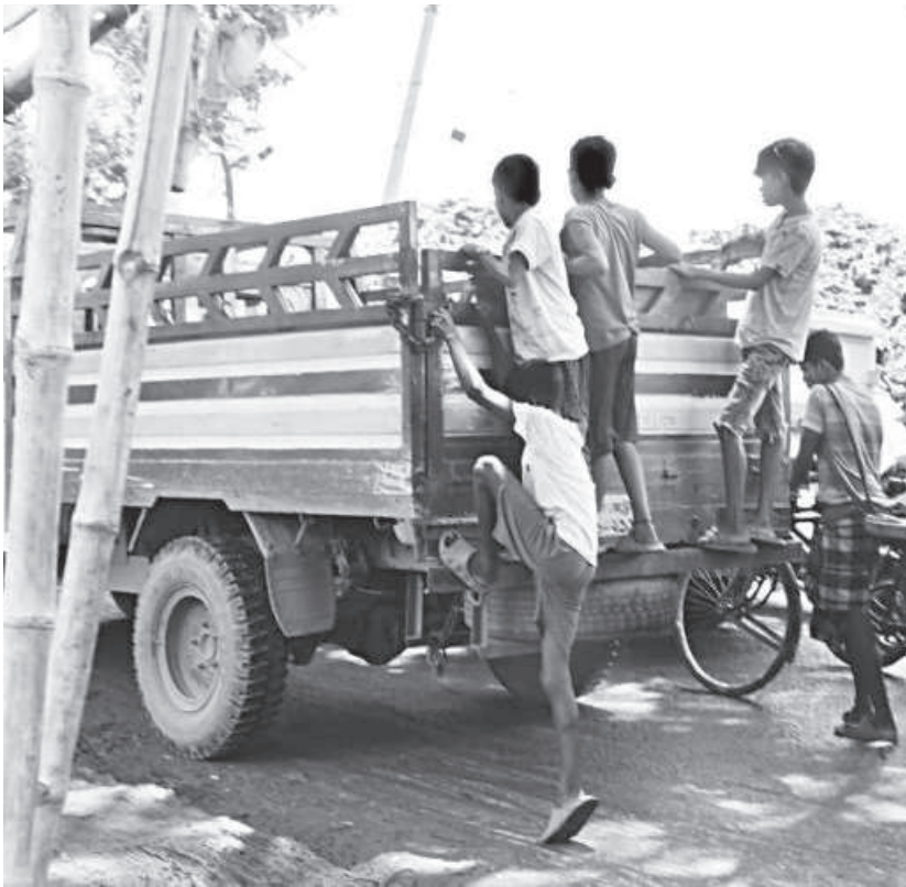
Children hang onto the back of a pick-up truck as it stands in a gridlock, without the knowledge of the driver. In the course of having “fun”, these kids put themselves at great risk. This photo was taken in Kamrangichar area recently.