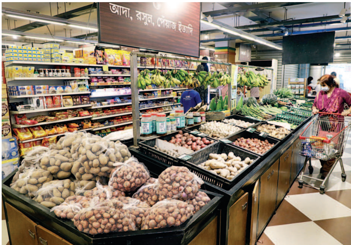
Customers have to tighten their belts when it comes to buying commodities because of the runaway inflation. Though sales of basic products have not been impacted much, consumption of nonessential or luxury products has dropped, according to officials of several supermarket chains. The photo was taken yesterday in the capital.