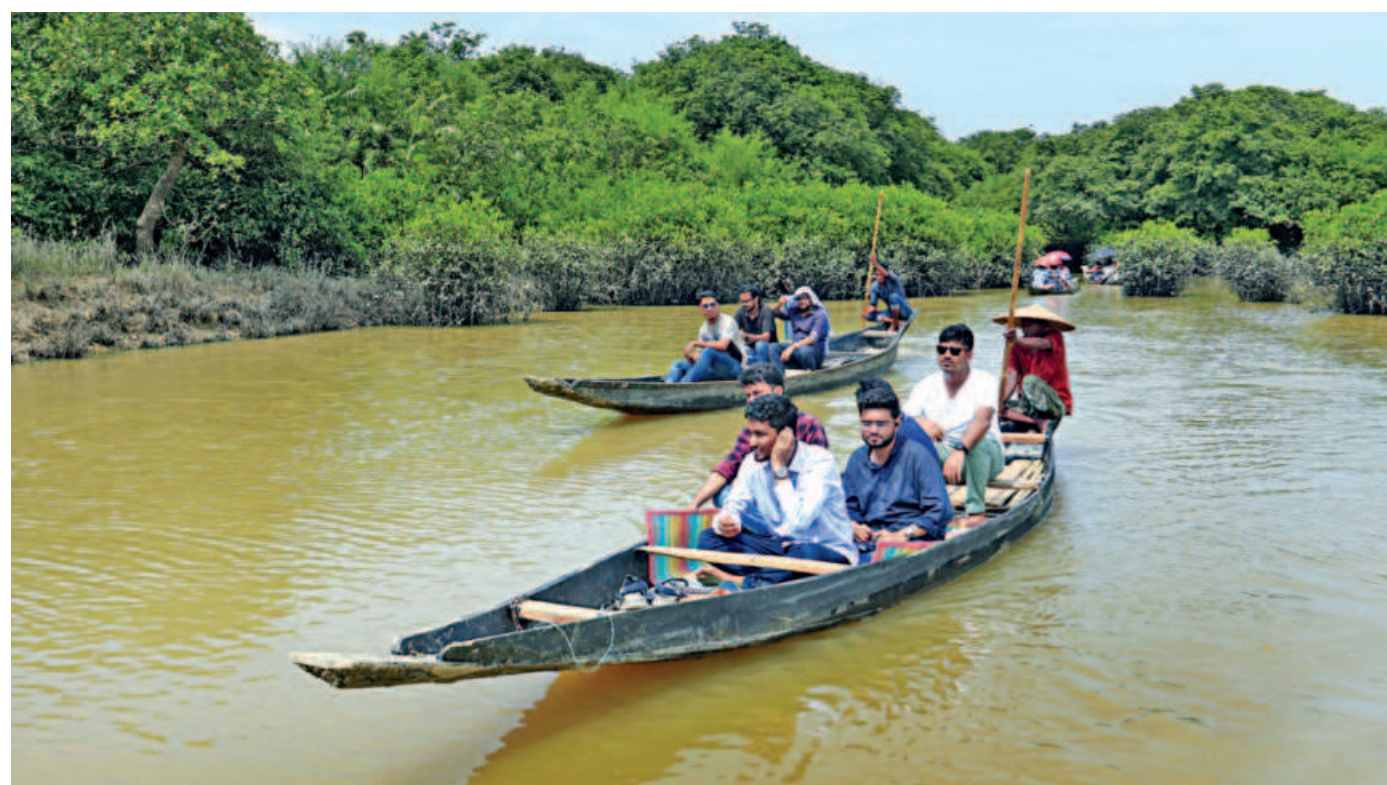
Tourists have again started visiting the Ratargul freshwater swamp forest in Sylhet's Gowainghat upazila following recent floods and intermittent movement restrictions over the past two years for the pandemic. Suffering losses all the while, the local hospitality and tourism industry is hoping for a resumption of social gatherings and travel in the ongoing period of rains. The monsoon season brings the swamp to its true form, submerging the forest whose canopy high above offers a serene environment for boats moving below. The photo was taken last Friday.

So, people with low incomes who do not come to superstores are certainly having to make do with inadequate nutrition amidst