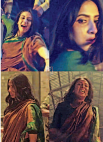
COLLAGE: REMNANT GLIMPSE

forever remember “Damal”. Whenever a new release comes along, I really can’t sleep or eat properly. I start to feel butterflies in my stomach, and am now eagerly awaiting the release of this film.