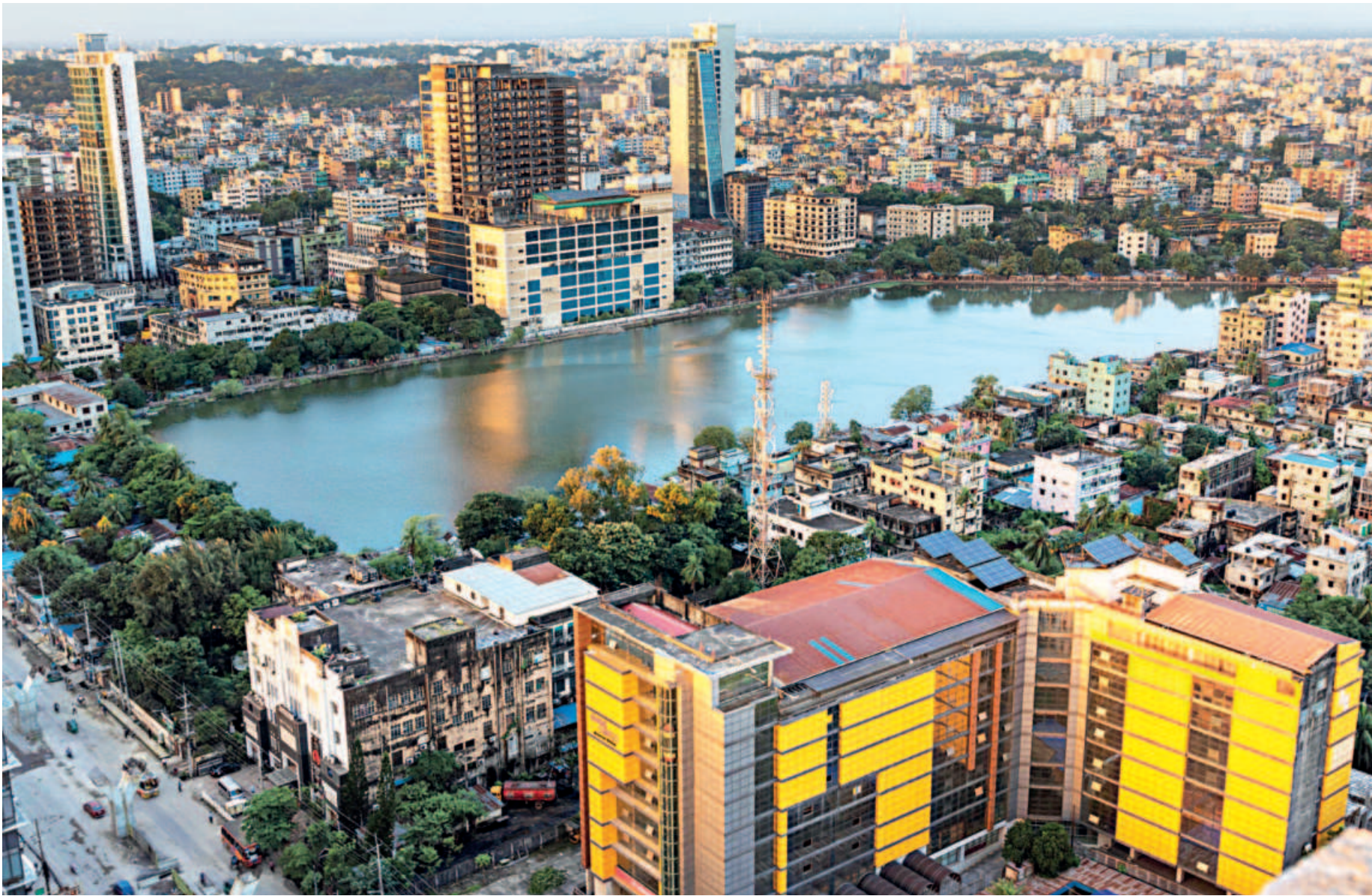
With its serene water and lush greenery, Agrabad Deba, a reservoir located at the heart of the port city, stands tall amid its concrete jungle. The century-old canal was actually born out of a construction project of the Bangladesh Railways in 1908, after large amounts of soil were excavated from the area to construct a railway line. Spanning across 27.4 acres, this reservoir not only offers a much-needed to residents but also serves as a reminder to preserve our waterbodies. This photo was taken recently.