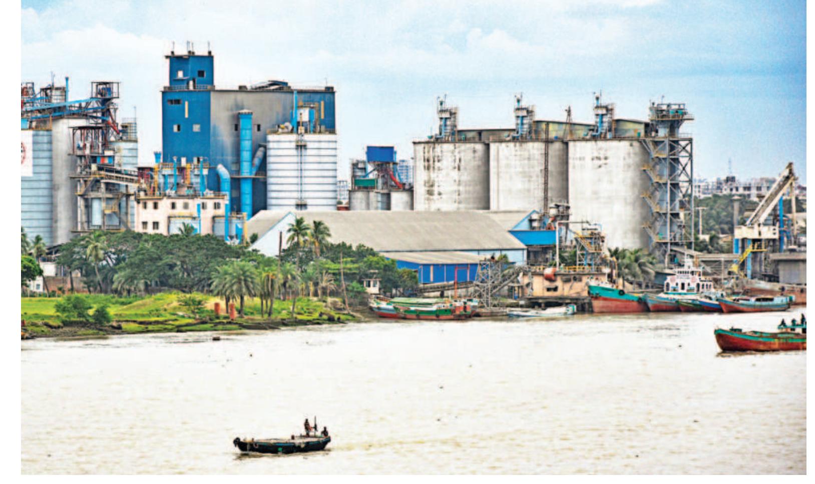
A cement factory by the Rupsha river in Khulna. Cement production grew just 0.26 per cent year-on-year to 1.79 crore tonnes in the last 10 months till April, according to the Bangladesh Bureau of Statistics. Industry insiders see a dearth in demand because of the government's austerity measures and the private sector's cautious stance in taking new construction projects.