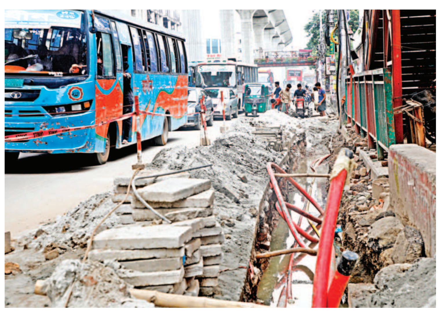
As part of development works, the authorities have dug up a side of the busy Kazi Nazrul Avenue near Karwan Bazar and kept it that way for a while. As work progresses slowly, the biggest sufferers are the commuters, who have to push through gridlock every day while traveling on the road. This photo was taken recently.

Muktijuddher Chetonar Sangbadik Forum at Jatiya Press