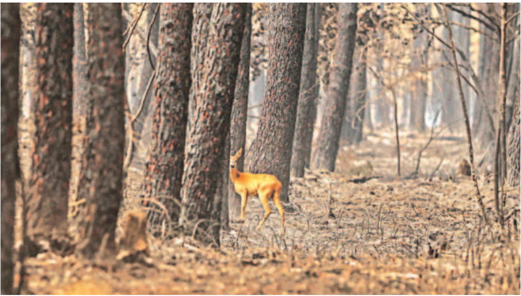
A doe looks on in a burnt forest following a fire in South Gironde, near Belin-Beliet, southwestern France, on Saturday.

In 2020, two hospital fires claimed the lives of 14 Covid-19 patients.