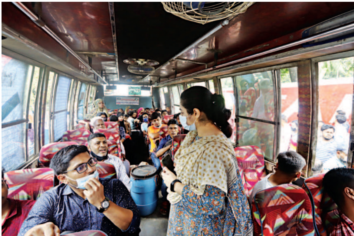
An executive magistrate running a BRTA mobile court near Kamalapur School and College in the capital checking if a bus was charging passengers more than the government-fixed rate.