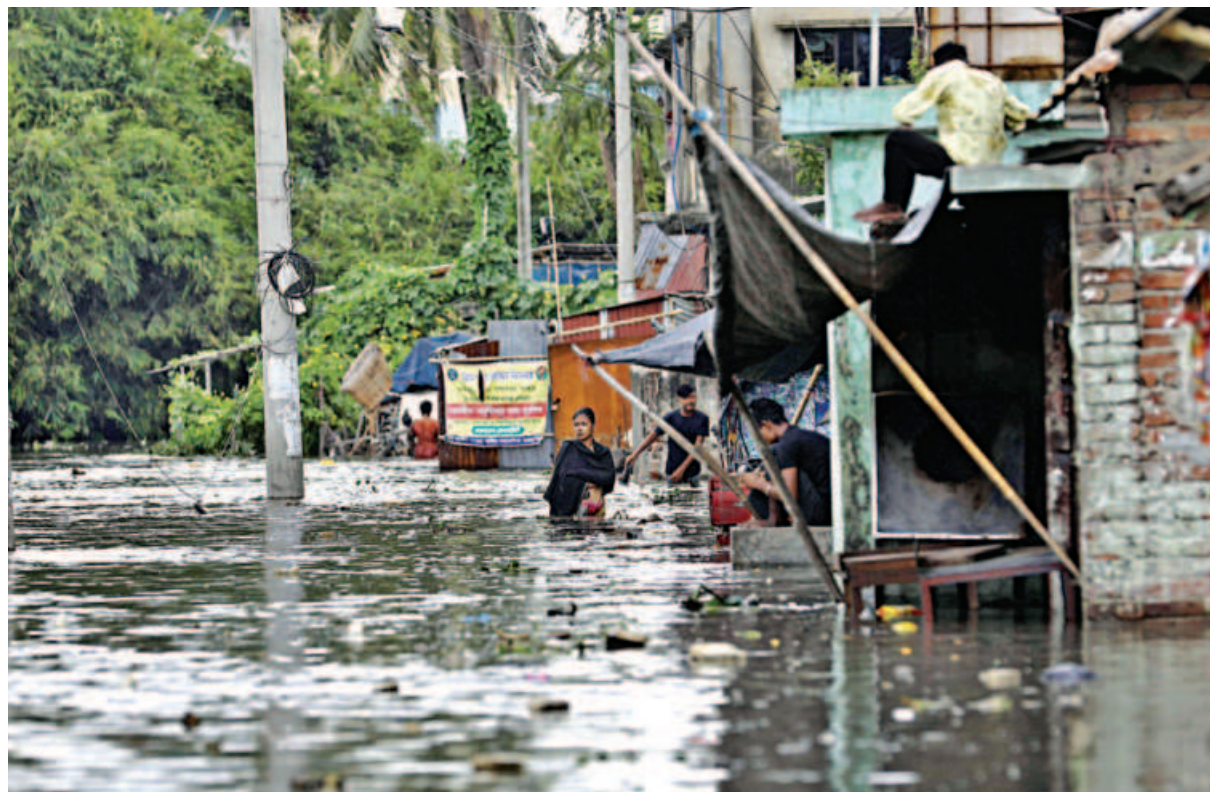
Tidal water inundates Agrabad, CDA residential, Khatunganj, and Bakulia areas of Chattogram city. This perennial problem of the port city continues to cause immense sufferings to locals. The photo was taken yesterday from Bakulia area.