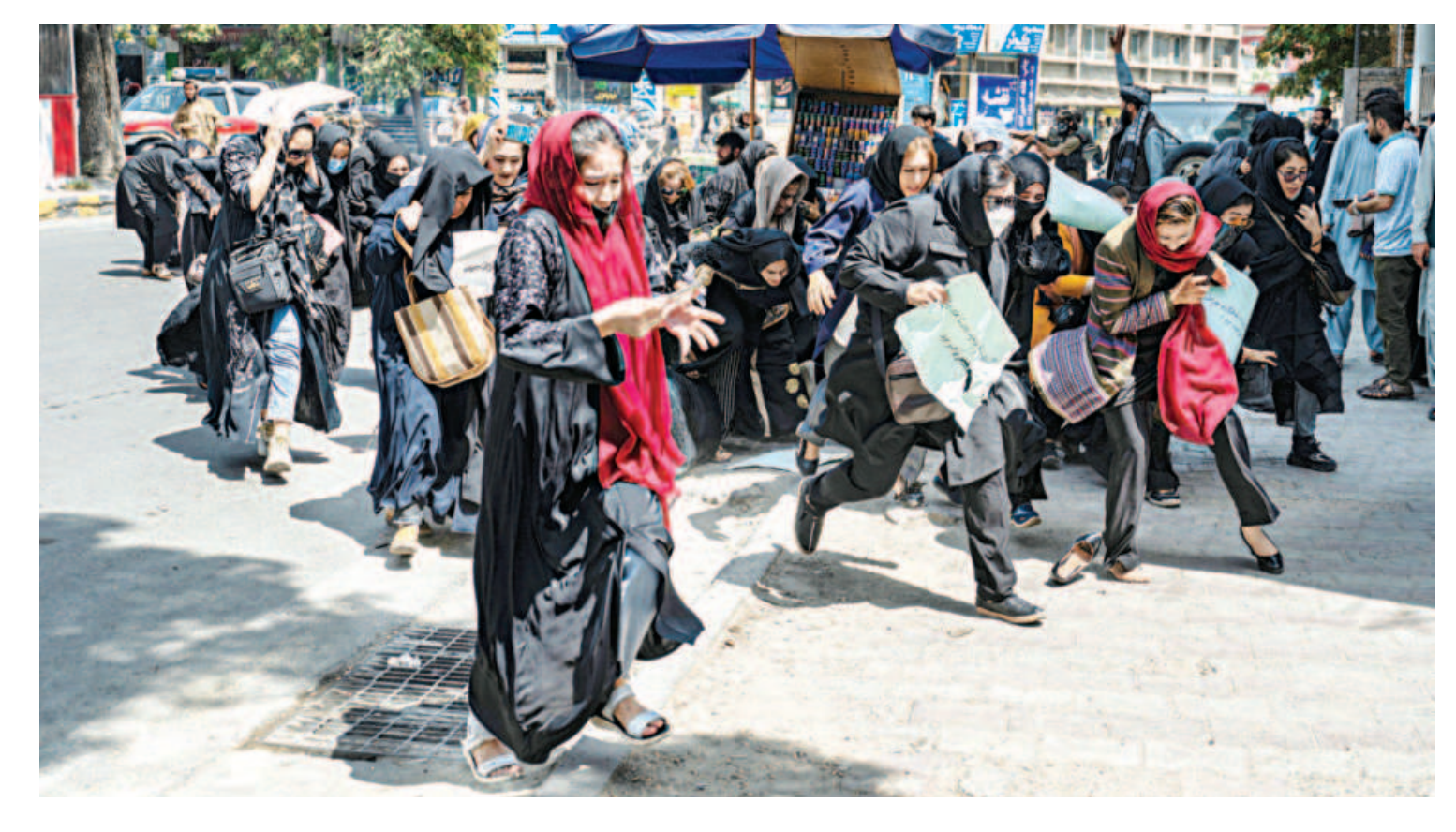
Taliban fighters fire into the air to disperse Afghan women protesters in Kabul yesterday. Taliban fighters beat women protesters and fired into the air as they violently dispersed a rare rally in the Afghan capital, days ahead of the first anniversary of the hardline Islamists' return

More than 14,866 irregular entries, "nearly three times more" than in July last year, were recorded via the Western Balkan route, which continues to be "the most active".