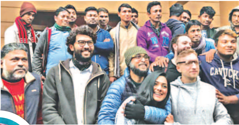
The crew of 'Saturday Afternoon' on the last day of shooting.

The film filed an appeal against the verdict