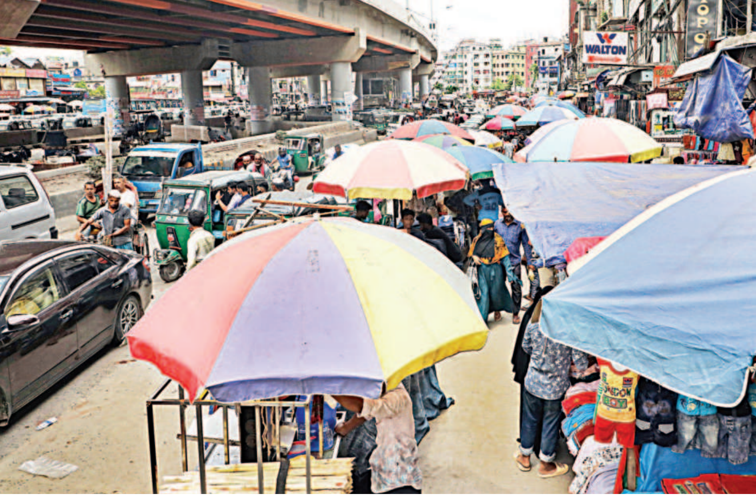
Under these large umbrellas are a boatload of hawkers, which have taken over almost half of this road, along with the footpath, at Jurain. After every eviction drive, these stalls make a routing return to the very same place, choking the road once again. This photo was taken yesterday.

DIPLOMATIC CORRESPONDENT Political parties working together to establish peoples’ rights despite ideological differences is the hallmark of democracy, said US Ambassador to Bangladesh Peter Haas yesterday. “Just to be clear. The US does not favour any political party over another,” he said. He was happy to see leaders of three major political parties -- Awami League, BNP and Jatiya Party -- sitting at a table together for healthy discussions in an event at a city hotel on the day. At the event, he was addressing the launching of the e-learning platform “Politics Matters” (politicismatters.com.bd). USAID’s “Strengthening Political Landscape” project, implemented by Democracy International, launched the platform to bring political knowledge and skills to the fingerprints of Bangladeshi political leaders and enthusiasts across the country. Information Minister and Awami League Central Joint Secretary Hasan Mahmud, BNP Standing Committee Member Amir Khasru Mahmud Chowdhury, Jatiya Party Presidium Member Barrister Shameem Haider Patwary were present at the programme. Haas said since his arrival in Bangladesh, he has met many political leaders and parties, and he will continue to meet more of them as he wants to learn more about Bangladesh.