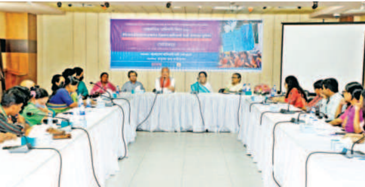
Speakers at the discussion yesterday. Bangladesh Indigenous Women’s Network, with support from Manusher Jonno Foundation, organised the event at The Daily Star Centre in the capital.