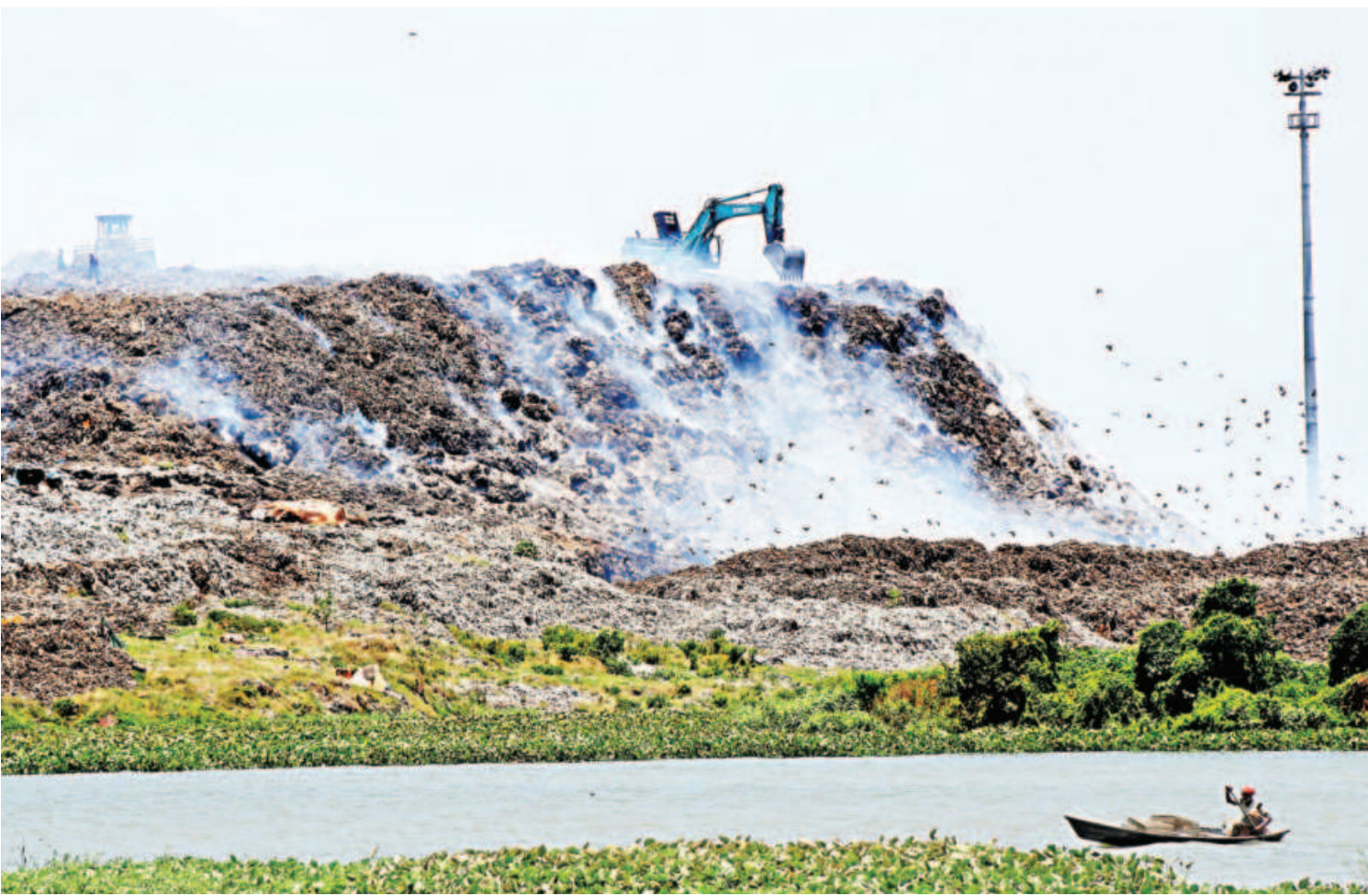
The pristine view of a boatman paddling in a waterbody surrounded by greenery would make anyone feel one with nature -- that is if the background wasn’t present. Behind this view is Aminbazar landfill, where piles of garbage are dumped daily. Now, a mountain of waste can be seen from the distance, with smoke, a product of the burning trash, billowing from below. This photo was taken recently.

Say speakers at events marking International Day of the World’s Indigenous Peoples