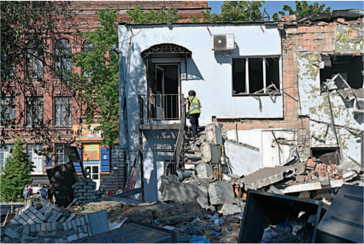
A Ukrainian expert climbs the stairs of the damaged building of a clinical medical laboratory following a Russian rocket strike in the second largest Ukrainian city of Kharkiv on Tuesday amid the Russian invasion of Ukraine.