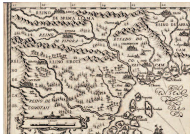
Portuguese map of Chittagong Hill Tracts (c.1615). "Chacomars" on the eastern bank of the river Karnaphuli and Arracam (present Rakhine State of Myanmar) can be seen.

But strained relations developed through the Company's attempt of making settlement with some individuals other than the tribal people for collecting cotton revenue, and especially the Company's attempt to lease out lands in hilly areas to men, not connected with the tribal rulers. Hill people had to face bilfold exploitation -- one in the form of revenue collection, and the other in the form of speculation. The introduction of an intermediary class, the lease-holders, in the Company's arrangement with the hill chiefs meant the exclusion of the hill