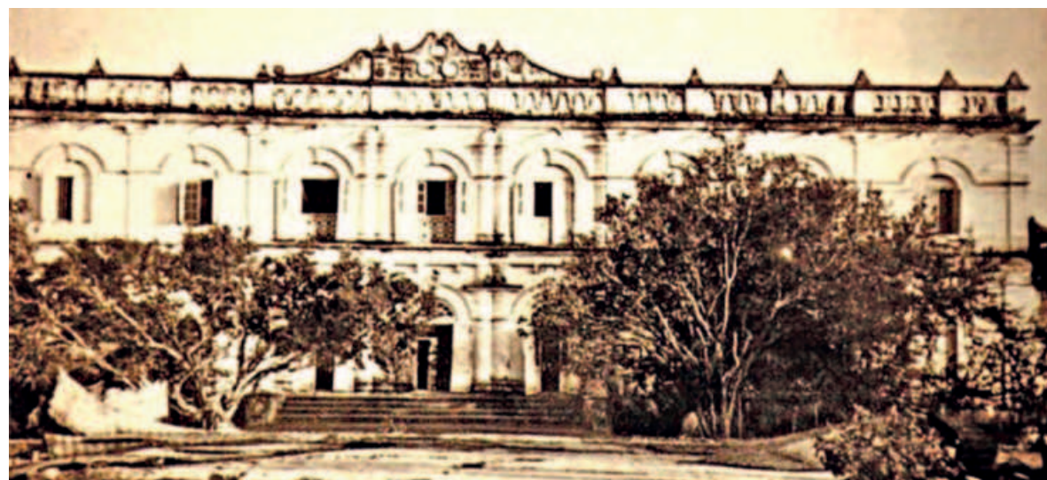
Chakma Raja Home.

It seemed that the task of subduing the hill people was not as easy as the Company thought to be. Moreover, the Company was baffled by their guerrilla operations. Having failed to subdue them by sending detachment the Company adopted a new strategy to confine them into the hills. This new strategy was, in effect, an economic blockade on the hill people's access to the markets of the plains in order to procure salt, tobacco, dried fish, and other commodities through barter trade. Besides, the Company's government tried to incite the Kukies through allurements to seize the adherents of Jan Baksh Khan. But the Company's plan of provoking the Kukies against Jan Baksh Khan and his associates proved abortive. The Kukies continued their resistance as usual against the Company's local agent and when in 1787 AD Jan Baksh Khan came to terms with the Company, the Company's authority had to seek his help to halt the Kukies. On the other hand, the hill people were getting supplies of salt, tobacco and dried fish from the plains in spite of the Company's prohibitive orders. The economic blockade enforced by the Company was successful when the Company posted guards at different strategic points of the hills. Ultimately, the people of Chittagong Hill Tracts were obliged to cease their resistance.