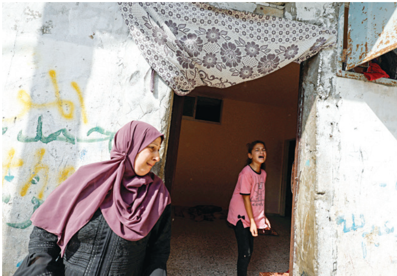
Palestinians react near a destroyed house amid Israel-Gaza fighting, in the northern Gaza Strip, yesterday. Israel and Palestinian militants have agreed to observe a truce in Gaza as proposed by Cairo, sources said, after a weekend-long pounding of Palestinian targets by Israel which killed 31 people.