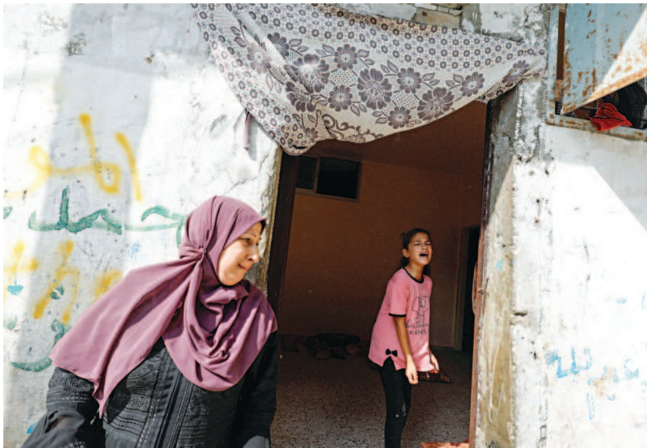
Palestinians react near a destroyed house amid Israel-Gaza fighting, in the northern Gaza Strip, yesterday. Israel and Palestinian militants have agreed to observe a truce in Gaza as proposed by Cairo, sources said, after a weekend-long pounding of Palestinian targets by Israel which killed 31 people.