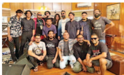
The members of Hothat.