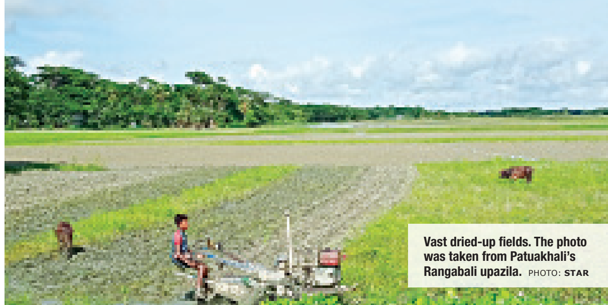
Vast dried-up fields. The photo was taken from Patuakhali’s Rangabali upazila.

About half of the targeted land was supposed to be brought under Aman cultivation till this time of the season, but the progress is very little as the fields are getting dries up. Minimum rainfall was recorded 778mm in the district in July last year, while it was only 181mm in July this year, the DD added.