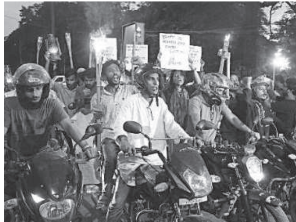
A group of people, including bikers, brought out a torch procession in Shahbagh yesterday evening, protesting the fuel price hike.

The government on Friday night hiked fuel prices by up to 51.7 percent. As per the new prices, a litre of octane now costs Tk 135, which was Tk 89 previously. Similarly, each litre of petrol now costs Tk 130, a Tk 44 rise from the previous rate. The price of each litre of diesel and kerosene increased to Tk