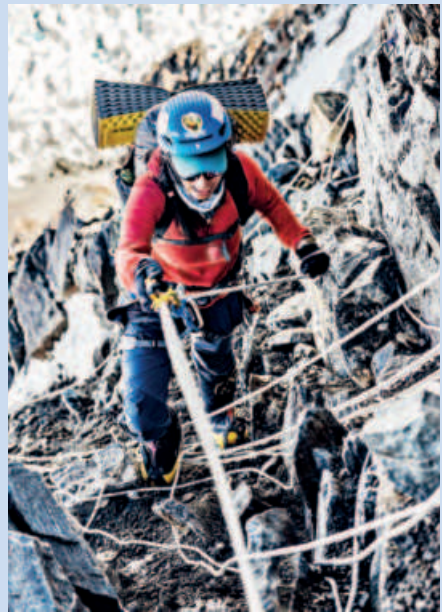
Crossing a maze of ropes. Old worn-out ropes on the mountain are a real threat to the climber's safety on K2.

She was named by Men's Journal as one of the 25 most adventurous women of the past 25 years, and by Outside magazine as one of 40 women in the last 40 years who have advanced and challenged the outdoor world through their leadership, innovation, and athletic feats.