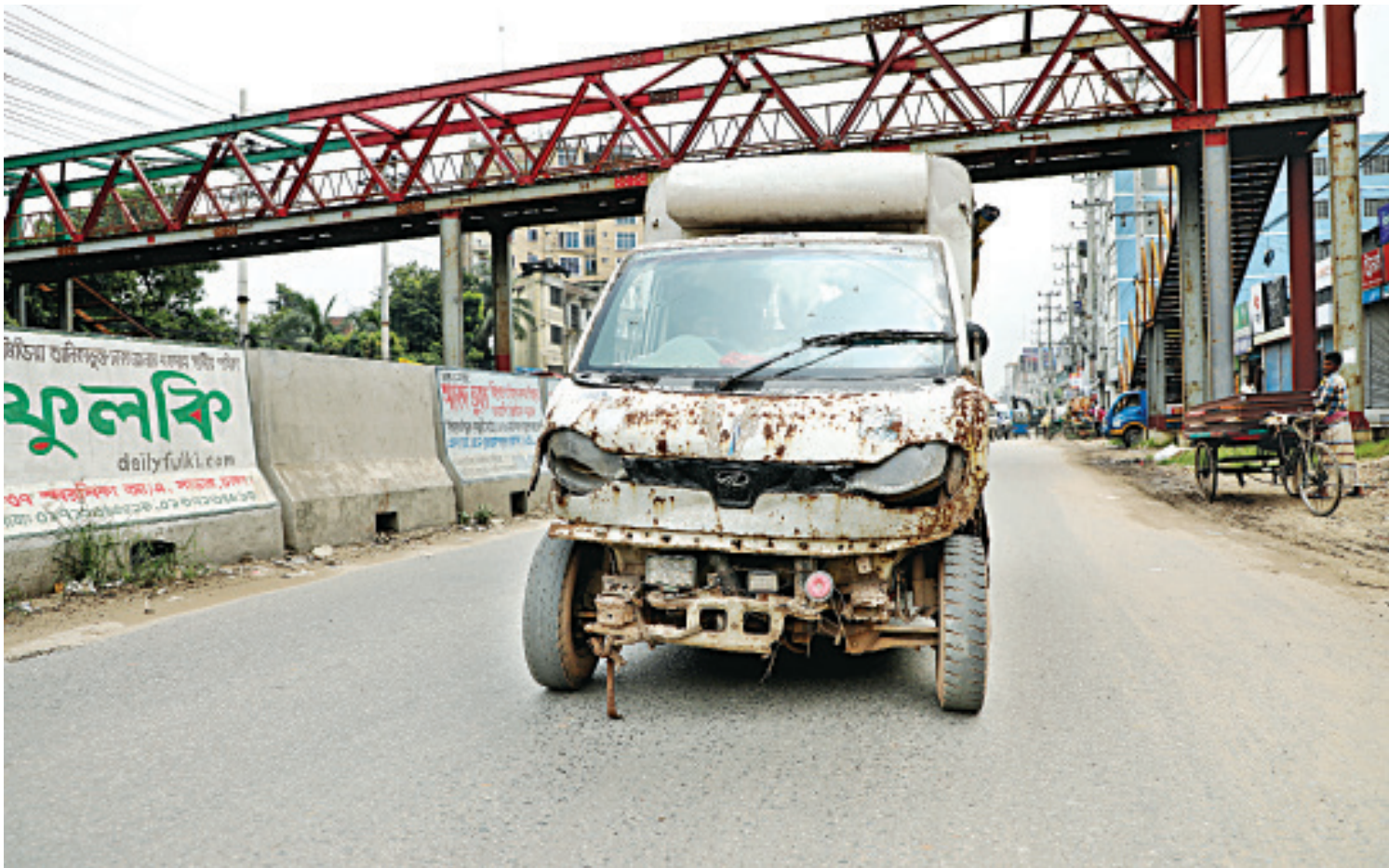
A human hauler that is barely held together and missing the front bumper plying the Dhaka-Aricha highway near the Savar bus stand yesterday morning. The ramshackle state of the vehicle strongly indicates that it is not fit for the road and its continued operation poses risks to its passengers and others.