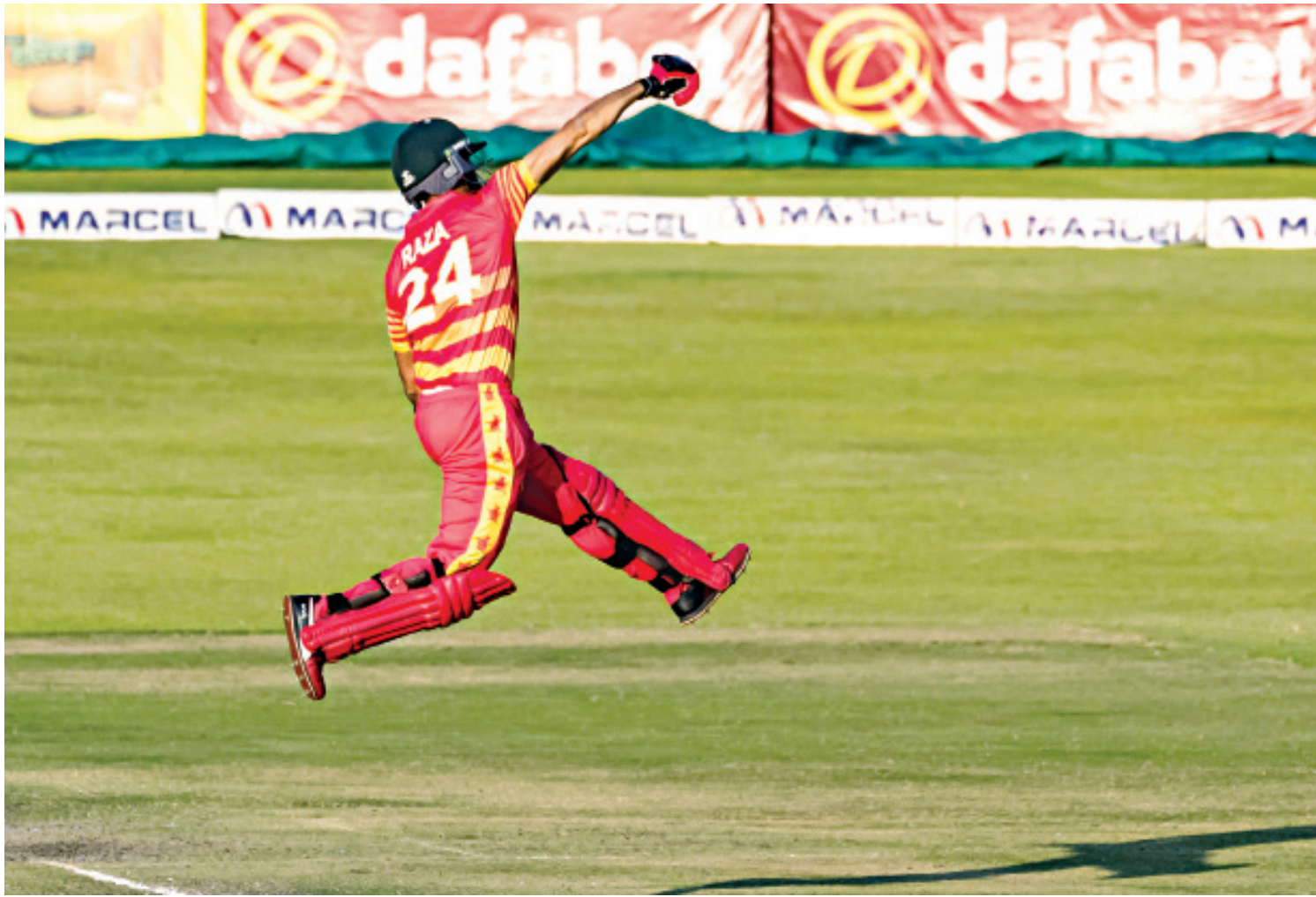
Zimbabwe batter Sikandar Raza jumps in the air to celebrate his century against Bangladesh during the first ODI at the Harare Sports Club on Friday. The veteran batter scored an unbeaten 135 runs off 109 deliveries as the hosts romped to a five-wicket victory.