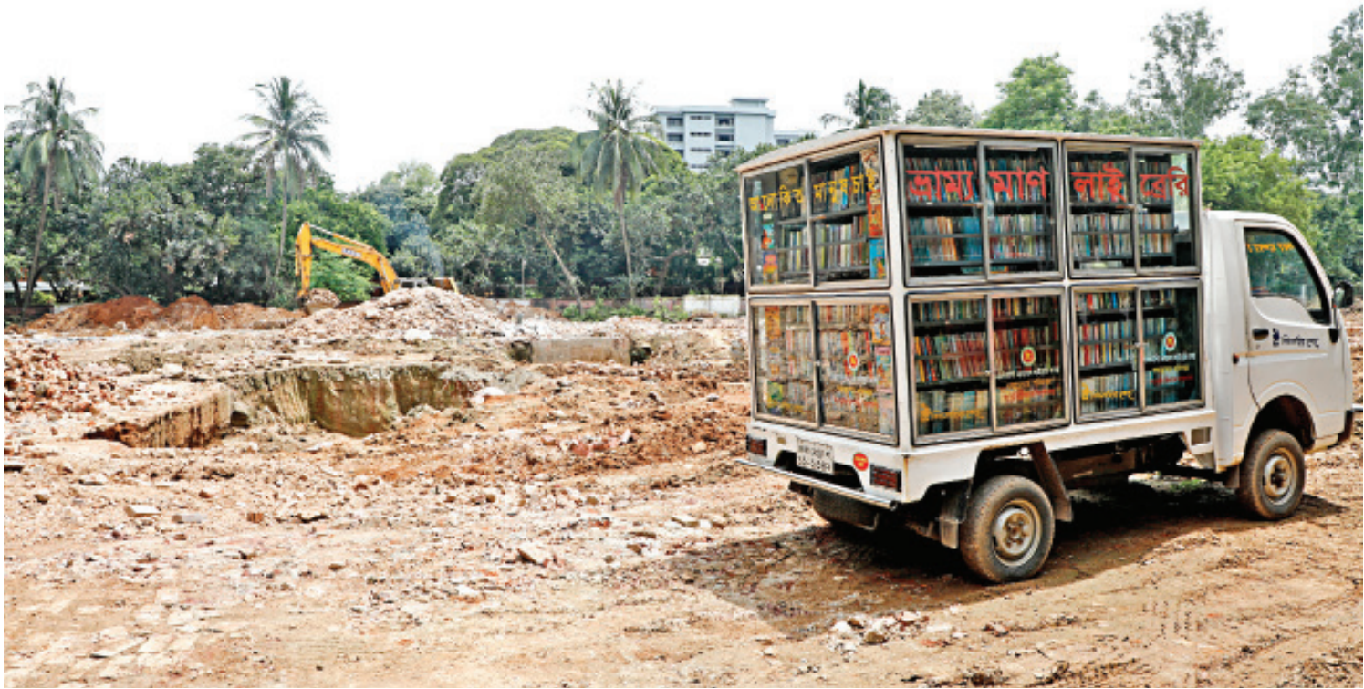
Rubble has now taken place of the library building. With demolition pretty much done, authorities will start construction following the new design any day now. The photo was taken yesterday.