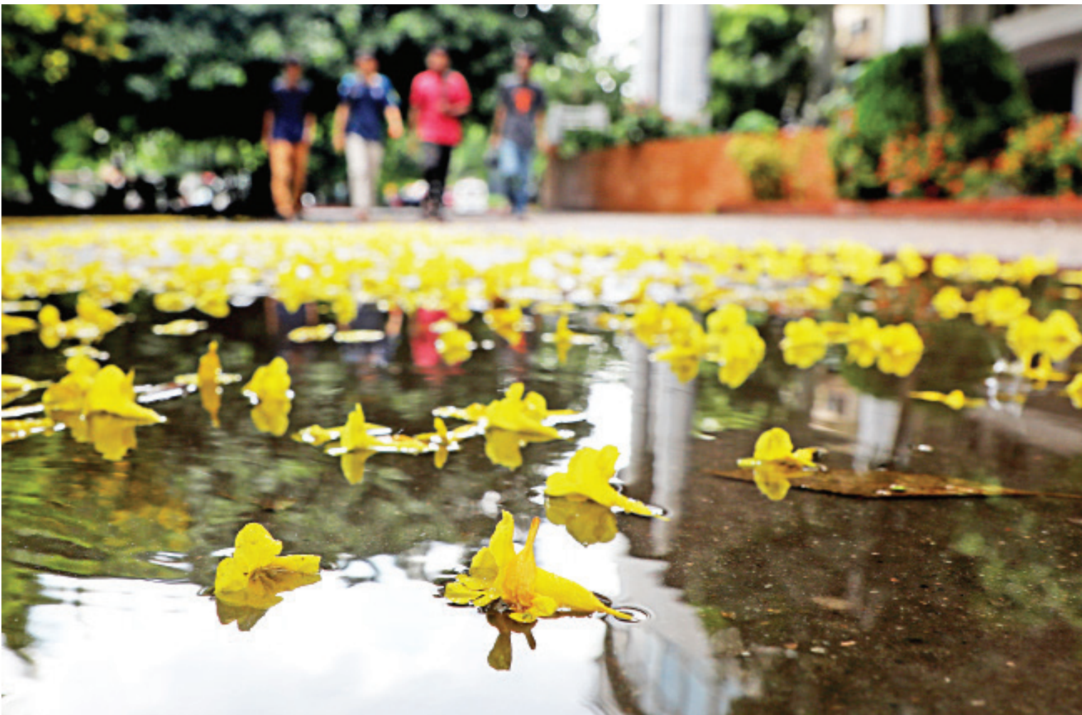
An array of alankanda flowers lie on the ground, brightening up the surrounding environment after a bleak period of rain at Mugda Medical College and Hospital premises. This photo was taken recently.

The meeting concluded to collaborate and share experience toward a more efficient partnership in the days ahead.