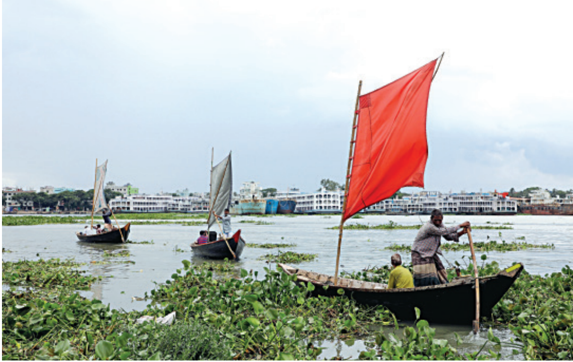
Even though traditional sailboats are a rare sight in Buriganga, several of them were spotted on the river, with their sails hoisted against the winds. One of the boats, with a vermillion sail, caught the attention of this photographer, as it painted a quintessential scene of Bangladesh's natural beauty against the green of the water hyacinths. This photo was taken at Gudaraghat in Mill Barracks area yesterday.