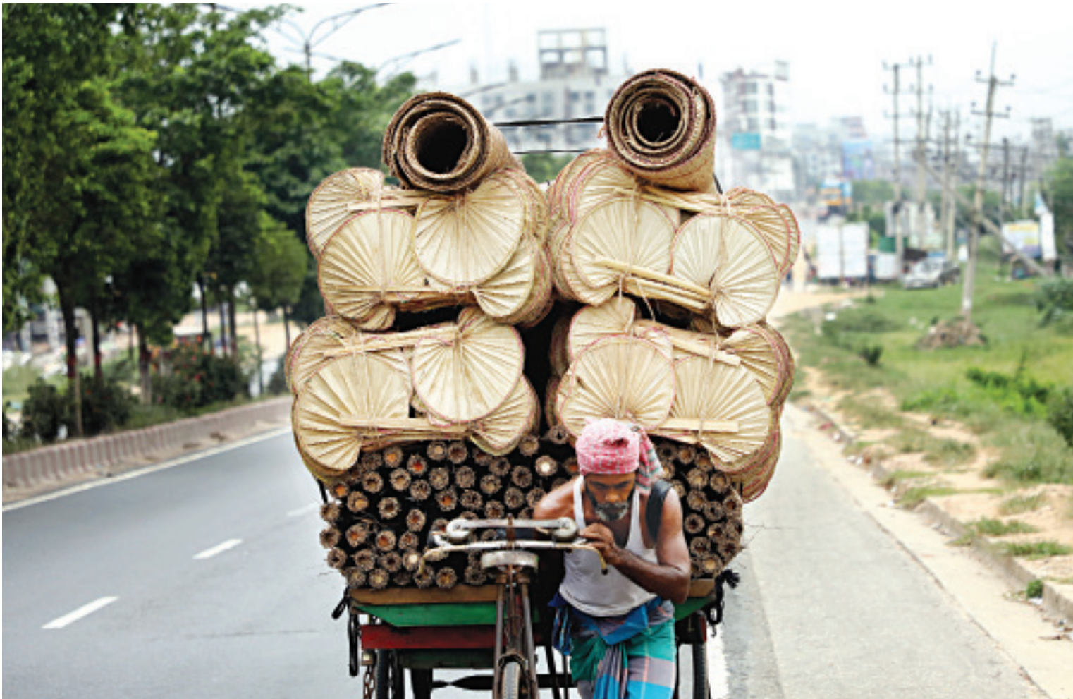
Although palm-leaf hand fans (locally known as haat pakha) were deemed to be a victim of modernisation -- it has come back in trend again with the recent load-shedding crisis. These fans, therefore, were being transported to Dhaka's Mirpur area, after the vendor purchased those from Savar's Naama Bazaar for Tk 25 per fan. This photo was taken recently.