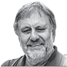
Slavoj Žižek, Professor of Philosophy at the European Graduate School, is International Director of the Birkbeck Institute for the Humanities at the University of London and the author, most recently, of Heaven in Disorder (OR Books, 2021).