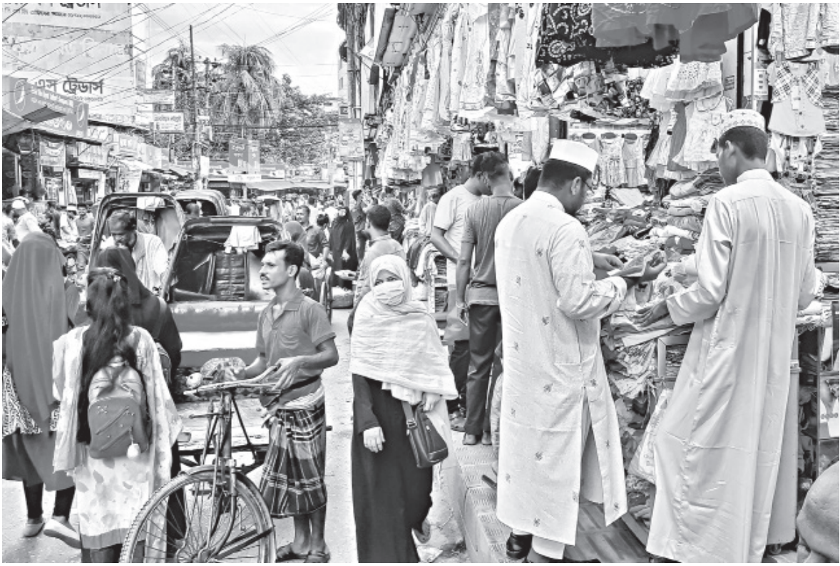
A woman walks on the narrow road as the footpath that was meant for her to tread on has been turned into a market, encroached by vendors and hawkers.