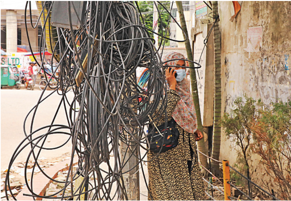
A jumble of internet and utility wires hangs on the footpath, obstructing pedestrian movement on Green Road. Although this isn't an isolated issue, the authorities do very little to address it. This photo was taken in front of the BEPZA office yesterday.