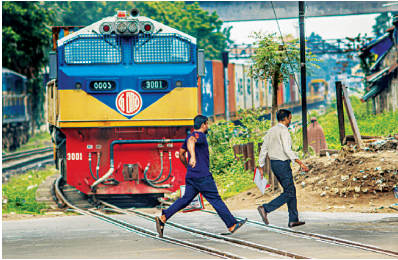
With a freight train just a few feet away, two men run across a level crossing in the capital's Khilgaon yesterday. They seem to have no regard for their safety though accidents at level crossings have been frequent, the latest being in Chattogram's Mirsharai that resulted in the deaths of 11 people.