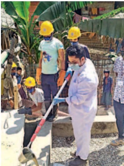
Swiss supported fecal sludge laboratory in Cox's Bazar is protecting the environment and public health.

One unique feature of Switzerland's response to the Rohingya refugee crisis is our direct presence on the ground in Cox's Bazar. Coordinated through a Swiss team stationed in the coastal town, Switzerland, among other interventions, has worked with the Department of Public Health Engineering (DPHE) to equip and open a fecal sludge laboratory in the city. Being the first of its kind in Bangladesh, this laboratory allows DPHE to test treated wastewater and fecal sludge from treatment plants in Cox's Bazar district and