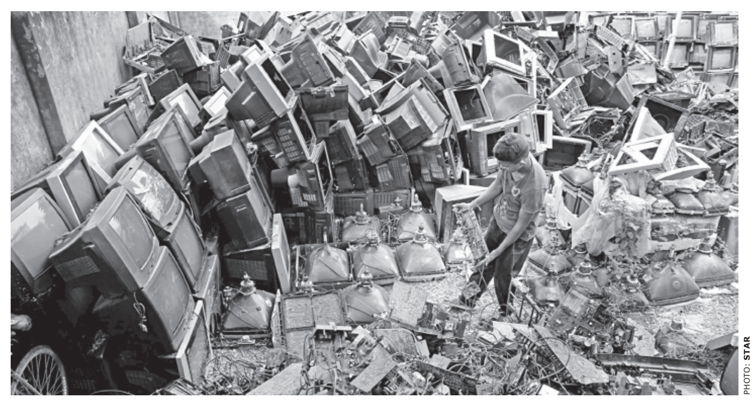
Citizens are the ones who enable circular movement of waste, for which they ought to be rewarded with social/economic benefits.