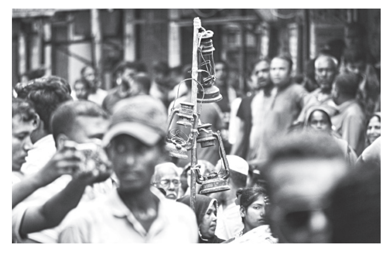
Protesting load shedding around the country and "corruption in the energy sector", Khulna city unit of BNP brought out a procession on KD Ghosh Road yesterday afternoon.

ৰামনী প্ৰাৰীগণকৈ জীবন বৃত্তান্ত, শিকাগত মোগ্যতা ও চাতুৰীৰ অভিজ্ঞতান সননগত্ৰ এবং নাম্প্রতিক পাসপোর্ট সাইজের ছবিসর জাগামী ১২ জাগামী, ২০২২ তারিখের মধ্যে উপরের विकासक जारक्सन कवरक शरह । पिरक्षणा, निराशणात रक्षरत अवकाति रक्षणी अक्षरि जनअवन