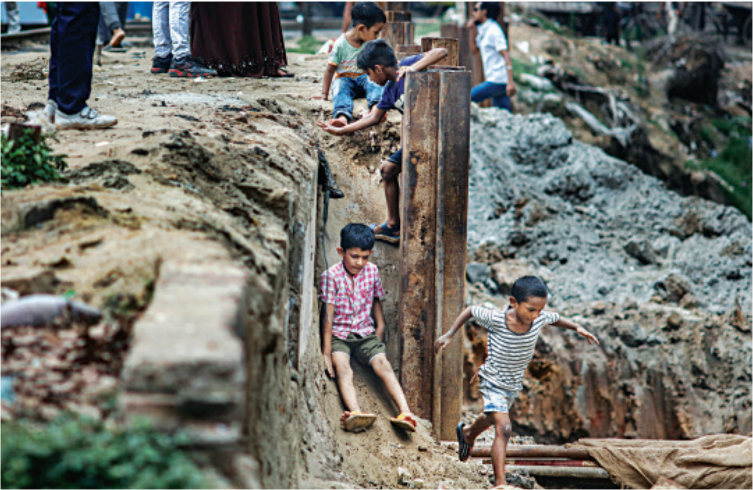
Local children go down a “slide”, or rather a pathway that was meant for construction workers, to have fun. With no safety measures in sight, these children are able to enter the site freely, exposing themselves to risks of accidents. This photo was taken from Sayedabad area recently.

At least 65 patients were admitted to different hospitals across the country in the last 24 hours till 8:00am yesterday. With the new cases, 17 from outside Dhaka, the total number of dengue cases rose to 2,495, according to Directorate General of Health Services (DGHS). Among the patients, 336 are still undergoing treatment. A total of 2,151 patients have been released from hospitals, while eight have died so far. Warning the city corporations of a major outbreak of dengue virus this year, experts suggested taking extensive measures immediately to control Aedes mosquitoes. Dhaka is at risk of a big outbreak, as clear, stagnant water, the breeding ground for Aedes mosquitoes, at under-construction buildings is abundant this time around.