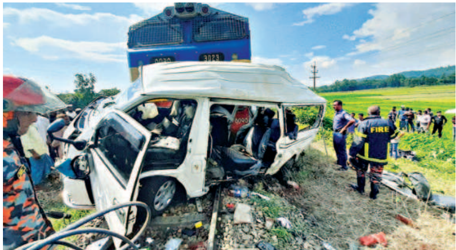
A mangled microbus lies on the rail track after the Chattogram-bound Mohanagar-Probhati Express hit the vehicle at Purba Khoiyachora Jhorna level crossing in Mirsharai upazila yesterday afternoon. The train dragged the vehicle about one kilometre.

WR4 SATIRE 'Do women even breathe after 10pm?'