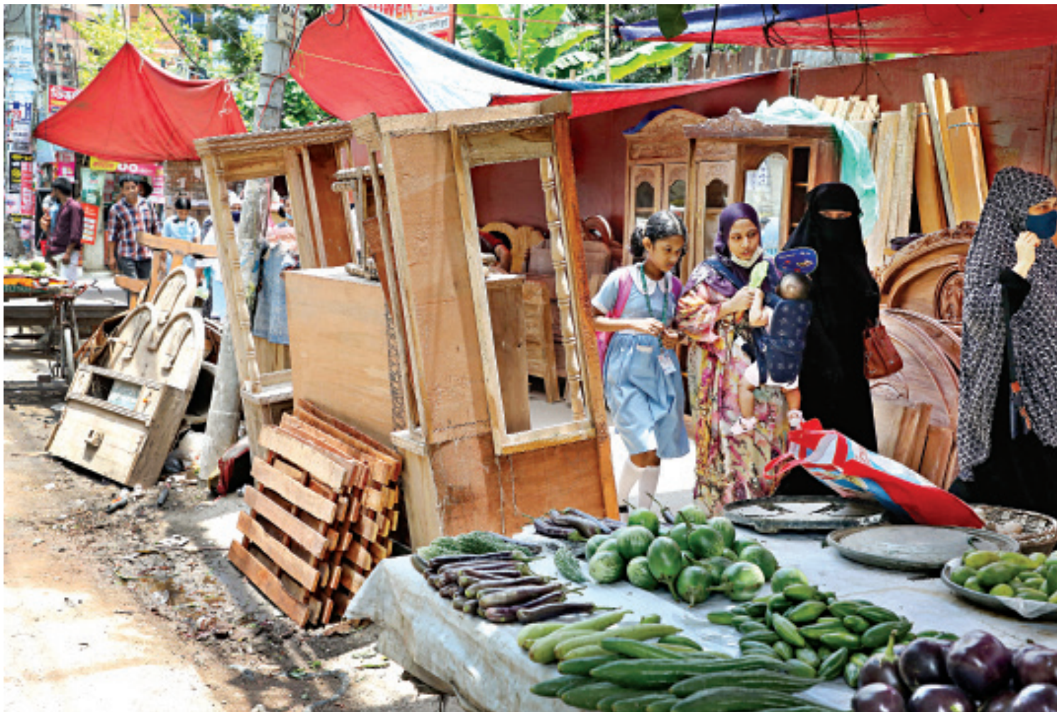
Traders have set up makeshift furniture shops occupying almost the entire footpath in the capital's Azimpur, leaving little space for pedestrians to walk. Vegetable vendors also take up space on the road, narrowing it. The photo was taken on Thursday.