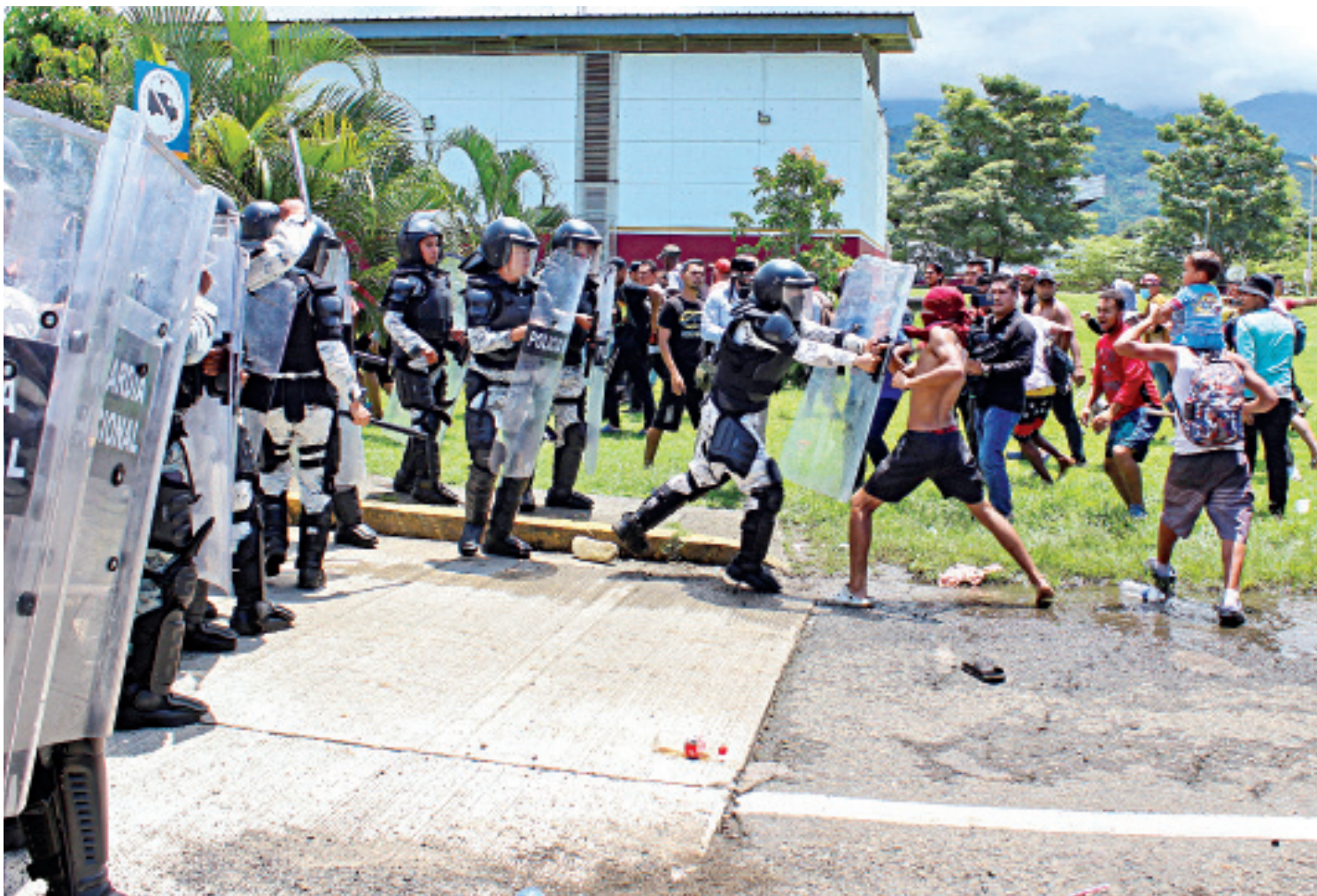
A National Guard officer pushes a migrant with his shield during a brief protest outside the office of the National Institute of Migration, as they got tired of waiting for the documents to cross the country towards the US border, in Huixtla, Mexico on Wednesday.

His latest threats come as South Korea and the United States move to ramp up joint military exercises, which have always infuriated the North as Pyongyang considers them rehearsals for invasion.