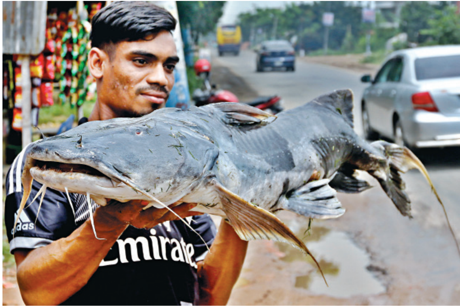
A man trying to sell a large Gangetic Goonch, locally known as Bagha Ayer, by the side of a road in Nagdarpar area of Khilgaon in the capital yesterday. The IUCN recognises Gangetic Goonch as an endangered species and as per the country's Wildlife (Conservation and Security) Act 2012, it is illegal to catch, sell and consume it.