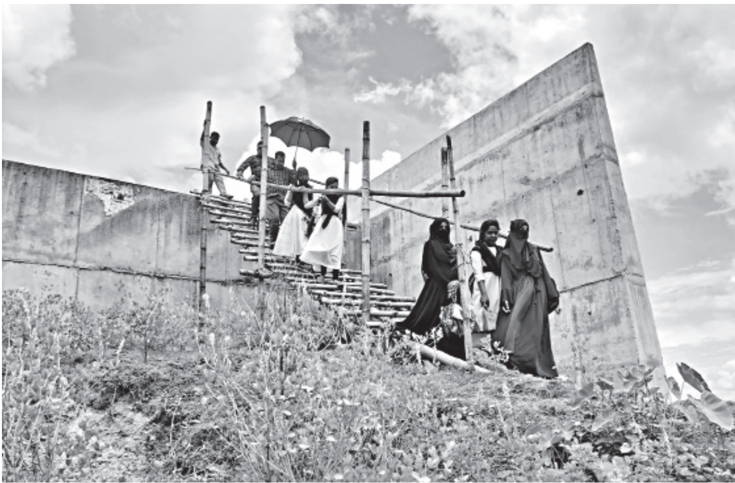
Even though Rajapur bridge over the Manu river in Moulvibazar was built to ease locals' commuting hassle, in reality, it is far from serving that purpose. The connecting road required to make the bridge functional is yet to see the light of day. As a result, people are using steep bamboo platforms on both sides of the bridge, risking their lives just to get across.