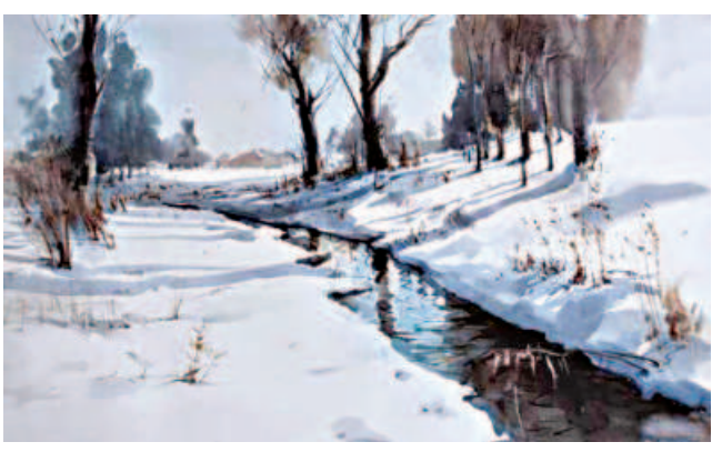
Winter in Canada

This Friday, the solo exhibition Organised by Galleri Kaya, the exhibition is titled "Water Color".