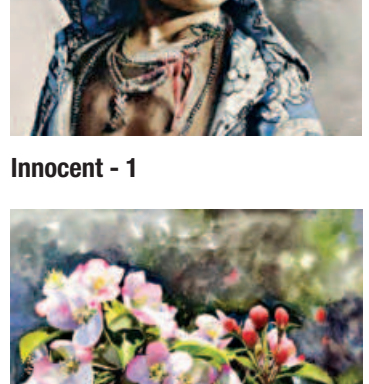
Flower Cherry Blossoms - 1