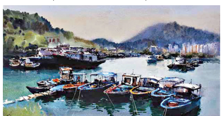
Hong Kong - 1

A total of 54 watercolour artworks were displayed at the exhibition. Covering everything from flowers and canals, to intricate portraits were showcased. Looking at some of the works on display, once can spot the intricate details that Sarker Helal Uddin puts into his work. His deft brushstrokes