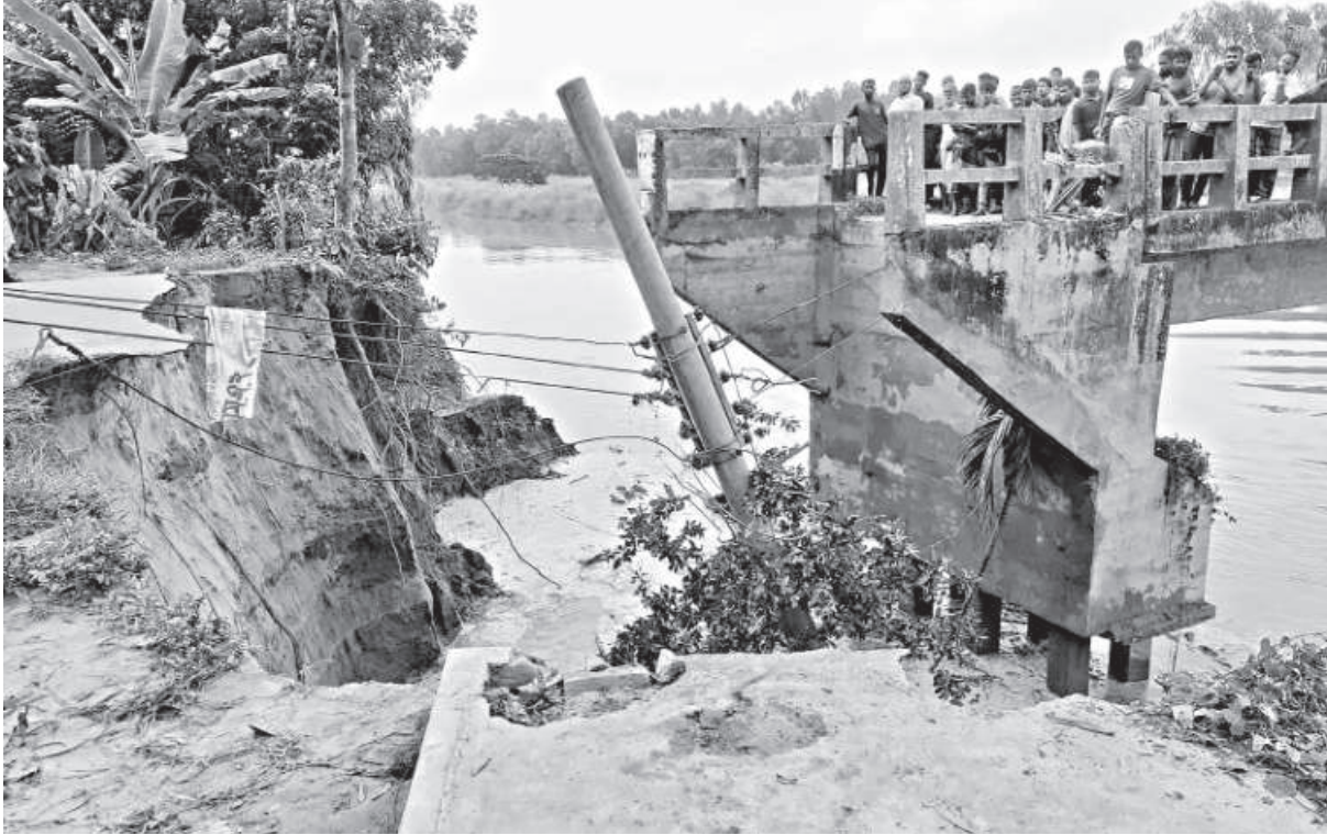
This bridge on Elengjani river in Tangail remains without an approach road as it collapsed due to water pressure, snapping road communication of at least 10 villages with Delduar upazila and district headquarters. The authorities are yet to take any action while thousands continue to suffer.