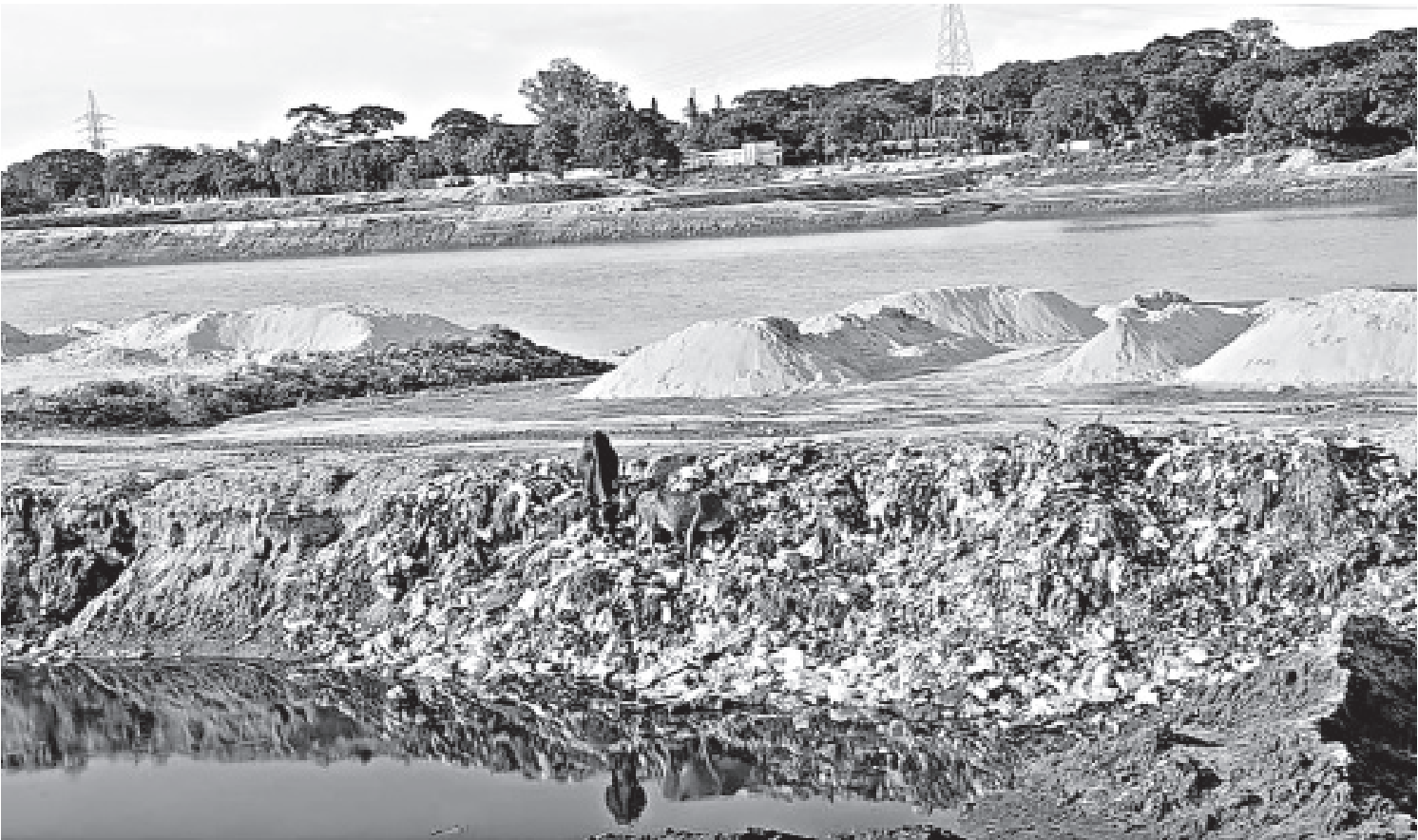
Waste being dumped into the Old Brahmaputra River at Kalibari Puran Gudaraghat has become a regular occurrence. What's more alarming is that the municipal trucks are involved in polluting the already dying river.