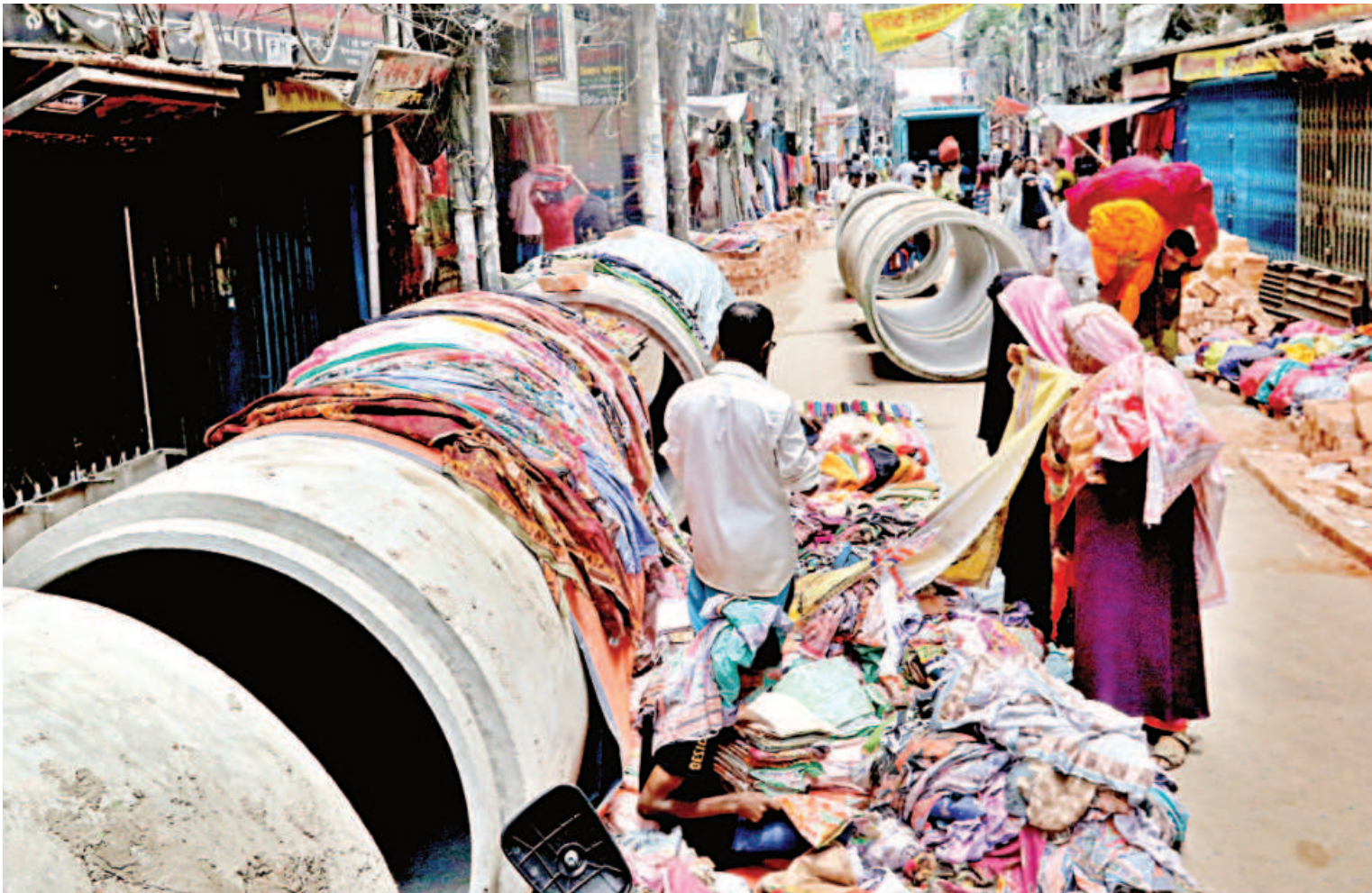
For months now, Old Dhaka's Islampur road has been dug up by DSCC to install a sewerage line, causing great peril to pedestrians. However, with no progress of the construction work in sight, salespeople of the clothing markets have set up shop on concrete pipes, left on the road -- having no other way of conducting business.

to a shortage. At the moment, some 150 to 200 tonnes of oxygen are being produced in Bangladesh," he added. As the country's hospitals stretched to their limit with the higher number of critically ill Covid-19 patients, the demand for medical oxygen also surpassed the SEE PAGE 4 COL 8