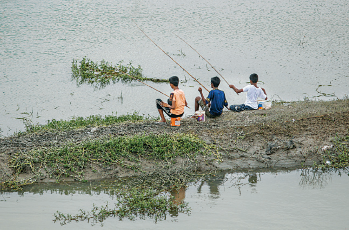
Prepping their fishing hooks with bait, local youths catch fish in the Turag river yesterday. With the water level rising due to the recent rains, the fish population also increased in the river. This photo was taken in the capital's Bosila area.