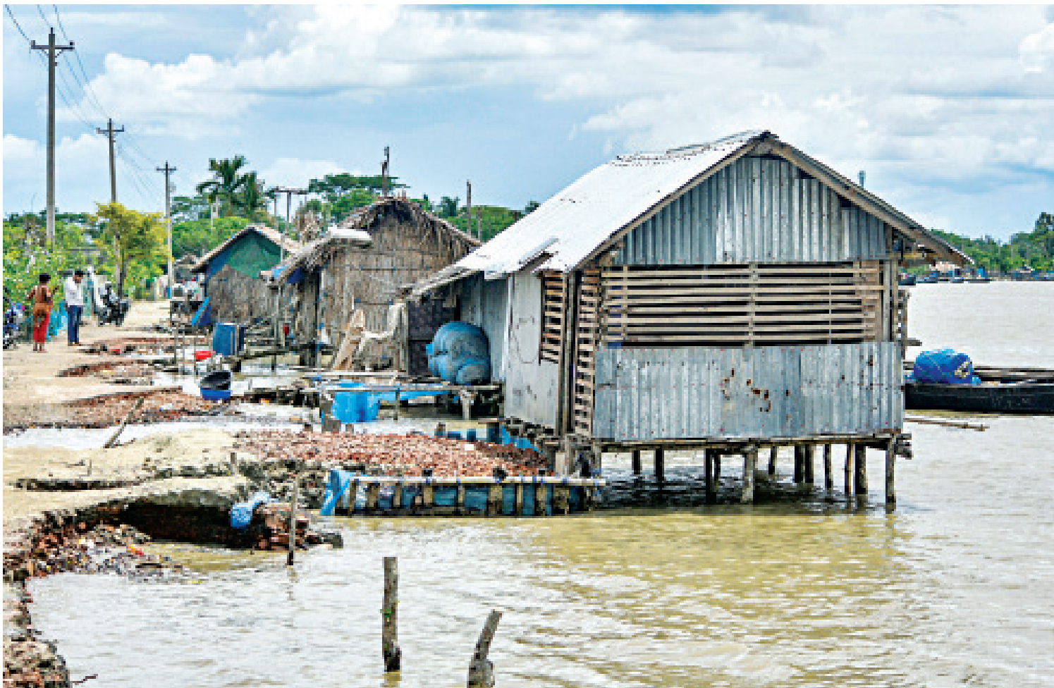
A few huts still stand on stilts while many others like these have recently been washed away by the Shyala river in Joymoni area of Mongla, Bagerhat, during high tide. Many poor families in the area have been rendered homeless by what locals say is an unusually aggressive nature of the river.