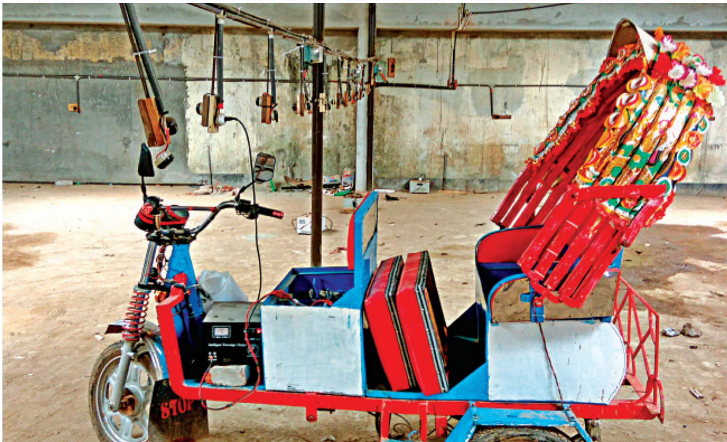
An electric rickshaw getting recharged at a garage in Ashkona area of the capital yesterday. The battery-powered rickshaws, banned by the High Court in 2014, are still quite common on the outskirts of the city and they consume power from the grid.