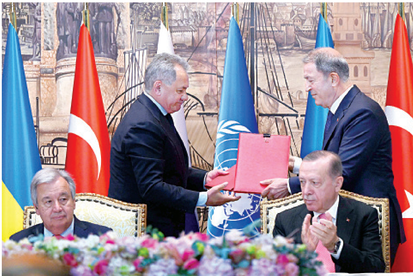
From left, UN Secretary-General Antonio Guterres, Russian Defence Minister Sergei Shoigu, Turkish Defence Minister Hulusi Akar and Turkish President Recep Tayyip Erdogan attend a signature ceremony of an initiative on the safe transportation of grain and foodstuffs from Ukrainian ports, in Istanbul, yesterday.