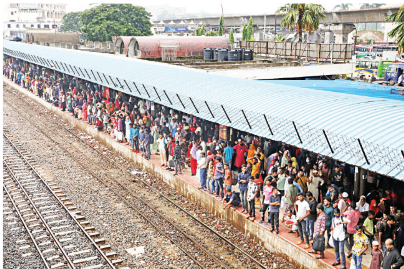
Hundreds of train passengers stuck on the Dhaka Airport Railway Station platform as angry students blocked the Nilsagar Express Train coming in from Kamalapur yesterday morning, as part of an ongoing protest against railway irregularities. Train movement was halted there from 9:00am to 12:20pm, causing sufferings to regular passengers. Related story on Page 3.