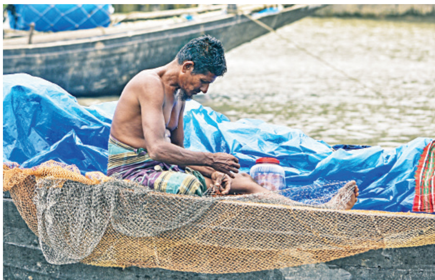
A fisherman works on his nets on the Chila Canal in Bagerhat's Mongla. As the ongoing 65-day fishing ban is about to end on July 23, fishermen across the country are readying the equipment they need to head back out to the sea. The photo was taken yesterday.