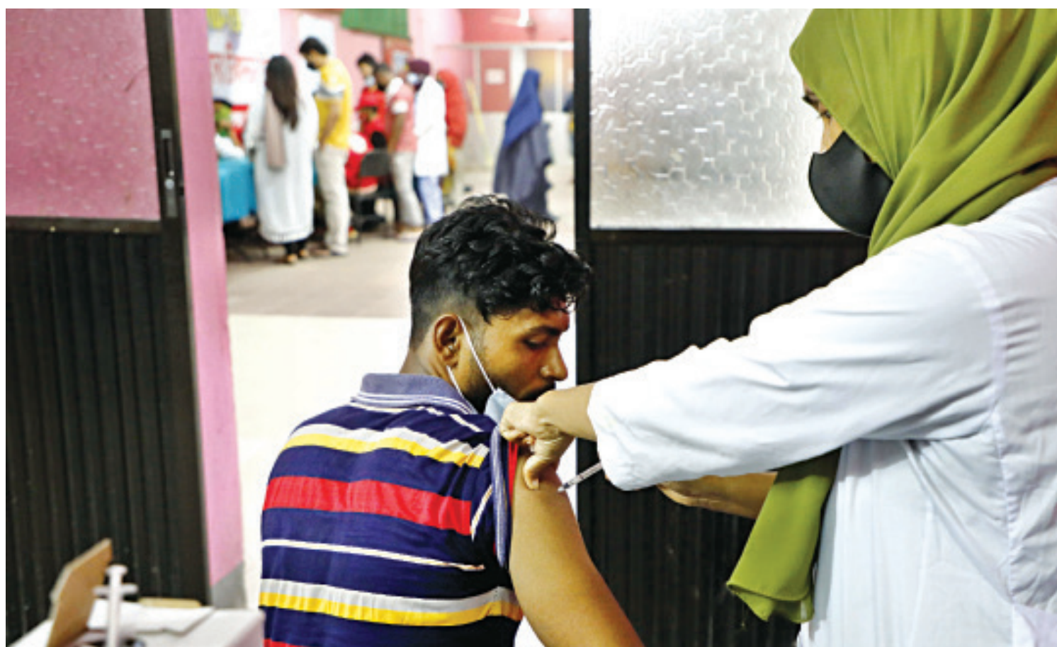
A man receiving a booster dose for coronavirus inoculation yesterday as the DGHS organised a day-long special campaign across the country. The photo was taken at Dhaka Medical College Hospital.