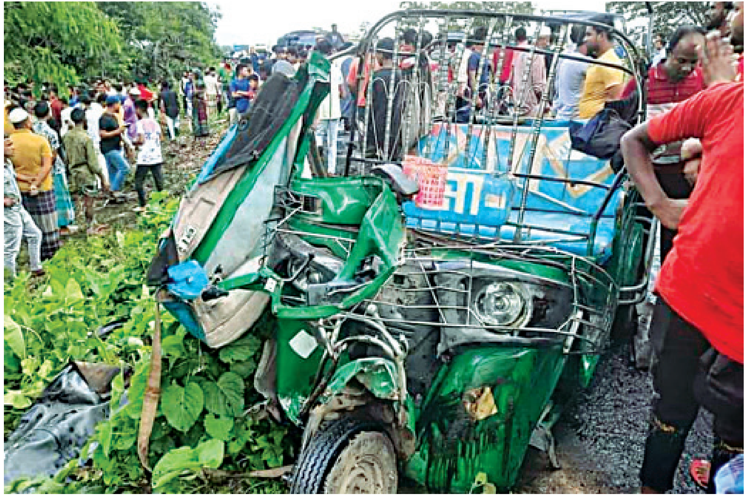
Three people were killed and 15 others injured in a four-vehicle pile-up on Dhaka-Sylhet highway in Brahmanbaria's Bijoy Nagar upazila yesterday. The CNG-run three-wheeler was crushed in the road accident.