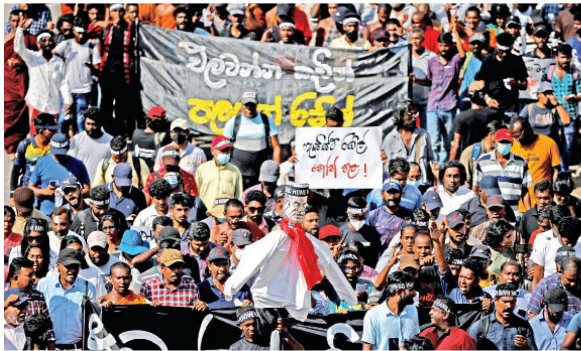
Protestors shout slogans as they carry an effigy of Sri Lanka's acting President Ranil Wickremesinghe during a protest in Colombo yesterday. The 225-seat parliament of Sri Lanka votes today to choose the new president, who will lead efforts to address the country's economic and political collapse. The House finalised three candidates yesterday.

AFP, Rio de Janeiro The Brazilian Amazon lost about 18 trees per second in 2021 as deforestation in the country increased by more than 20 percent, according to a satellite data-based report released Monday. The Mappiomas report said the country lost some 16,557 square kilometres (1.65 million hectares) of indigenous vegetation in 2021 - an area bigger than Northern Ireland. In 2020, the area lost was 13,789 square kilometres. Nearly 60 percent of land deforested in 2021 was in the Amazon, the world's largest tropical rainforest, the report said. "In the Amazon alone, 111.6 hectares per hour or 1.9 hectares per minute were deforested, which is equivalent to about 18 trees per second," according to Mappiomas, a network of NGOs, universities and technology companies. Clearing land for farming was the main driver, accounting for almost 97 percent, it said, with illegal mining also a major factor. In the last three years, coinciding with the presidency of far-right President Jair Bolsonaro, the tree cover lost in Brazil was about 42,000 square kilometres - "almost the area of the state of Rio de Janeiro," said the report.