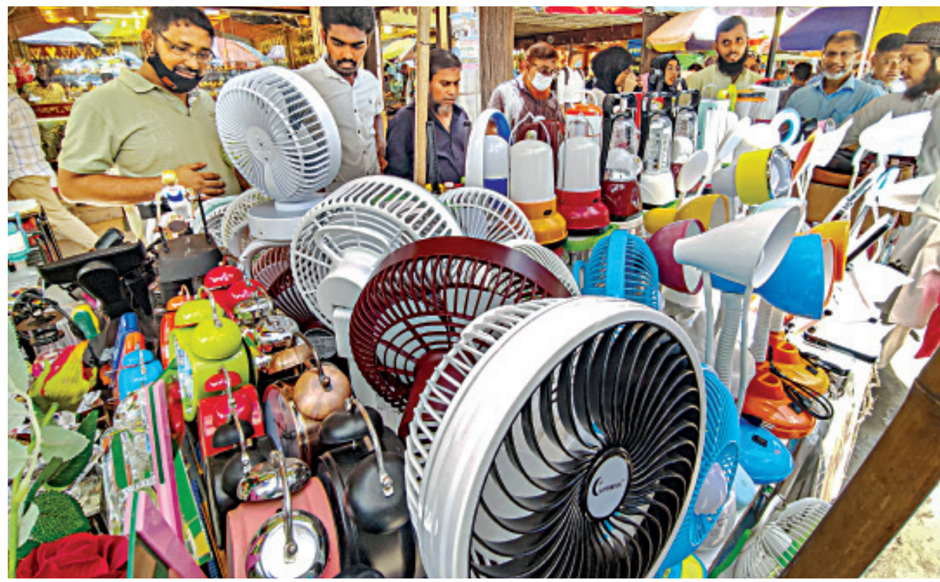
People looking at rechargeable battery-powered fans and lamps at a hawker's stall near Baitul Mukarram in the capital yesterday. Many are turning to such devices due to power cuts during the summer heat.