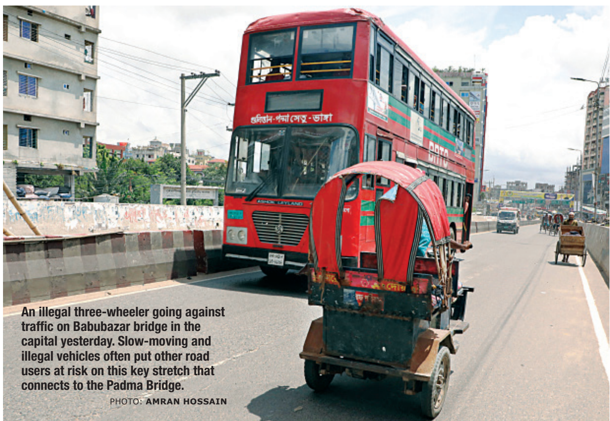
An illegal three-wheeler going against traffic on Babubazar bridge in the capital yesterday. Slow-moving and illegal vehicles often put other road users at risk on this key stretch that connects to the Padma Bridge.