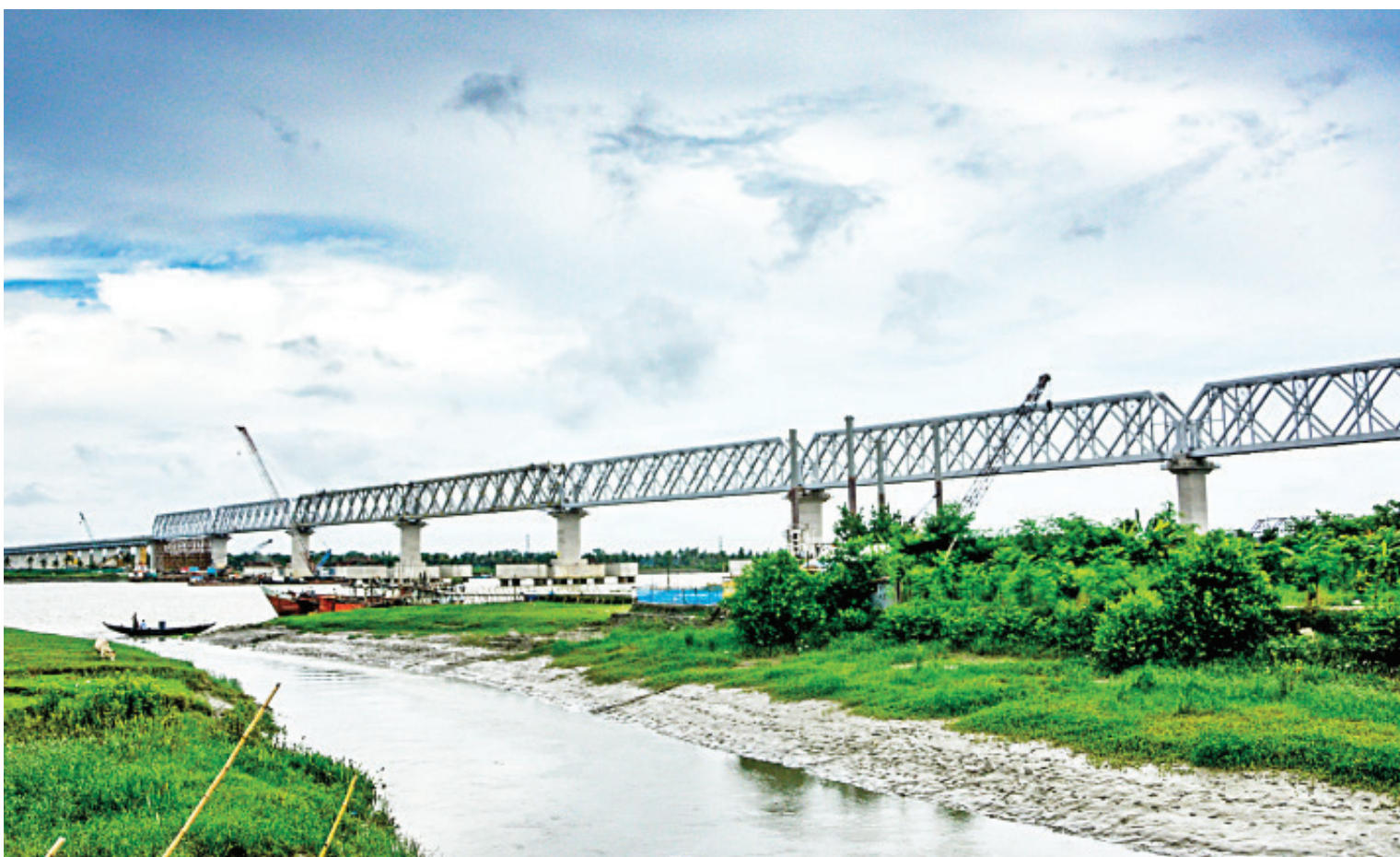
The seventh and last span of the Rupsha railway bridge has been installed recently. With all spans in place over the Rupsha river, the Khulna-Mongla Rail Link project inches towards completion. This 5.13km-long railway bridge will be the country's longest one. The photo was taken near Lobon Chora Road in Khulna's Rupsha upazila recently.