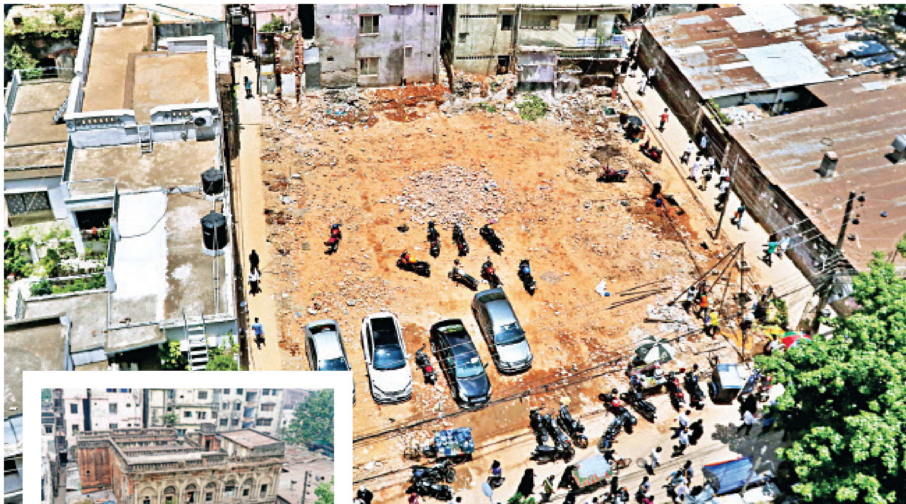
Vehicles parked in the space where the historic Neelam Ghar once stood. The century-old establishment on Old Dhaka's Court Street was recognised by conservationists as a rare feat of masonry. However, after the heritage site was leased out to the Dhaka Bar Association by the Deputy Commissioner's Office, the two-storey building was demolished to make room for a 20-storey one. The photo was taken yesterday. Inset , what the Neelam Ghar, literally meaning auction house, used to look like.